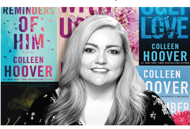
Five of Colleen Hoovers books are currently in publishers Weekly's list of the top 10 best-sellers.