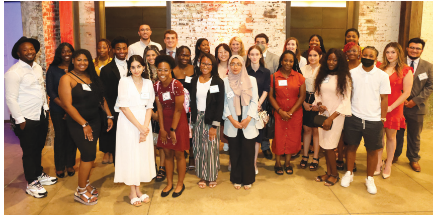
Central Scholarship’s 2022 student awards winners