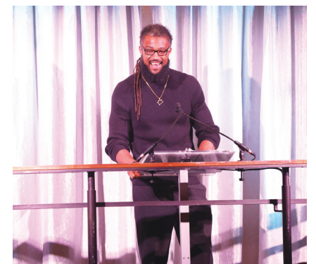
Artist, educator, entrepreneur, and former NFL player Aaron Maybin was this year’s keynote speaker.