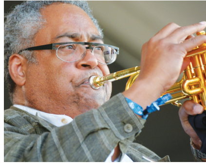
Jon Faddis