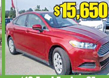
$15,650 '13 Ford Fusion SE #U1483, Alloys, PW, PL, 29K Miles

248 Cox Creek Parkway, Florence, AL - www.JerryDamsonNissan.com