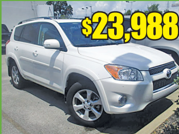
$23,988 '12 Toyota RAV4 LTD #U1493, Sunroof, Leather, 1 Owner, Only 44K Miles