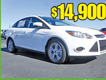
$14,900 '14 Ford Focus SE #U1442, Sunroof, Tilt, Cruise