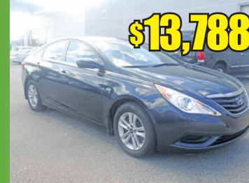
$13,788 '12 Hyundai Sonata SE #15N5616A, XM Radio, PS, PL, PW