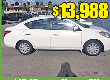
$13,988 '12 Nissan Versa SV #15N5492A, 1 Owner