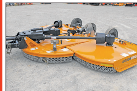
BW12 Woods 12' batwing, like new, warranty remaining $8,950