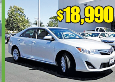
$18,990 '14 Toyota Camry LE #15N5584A, Leather, CD, Only 15K Miles