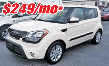
$249/mo* '13 Kia Soul + #C150506A, Auto, Sunroof, Only 20K Miles