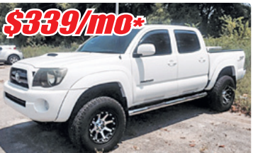
$339/mo* '10 Toyota Tacoma PreRunner #C150684A, Hard To Find!