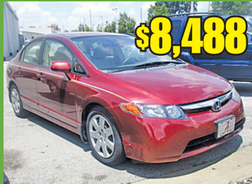
$8,488 '08 Honda Civic LX #15N5729A, PW, PL, Cruise, Local Trade