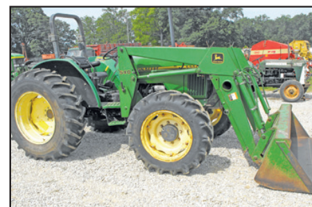
5300 John Deere 4x4, w/JD 540 loader, ALL NEW TIRES! 5,456 hrs. solid tractor $16,500