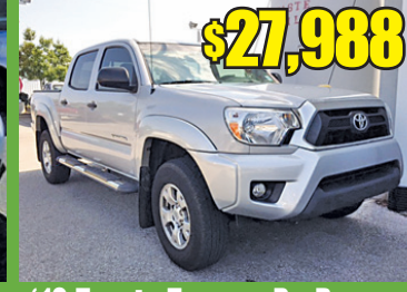
$27,988 '12 Toyota Tacoma PreRunner #15N5804A, Double Cab, V6, 40K Miles