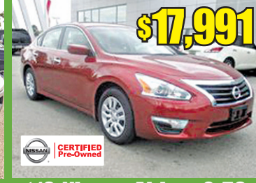
$17,991 '13 Nissan Altima 2.5S #U1446, Pwr Driver Seat, PL, CD, 33K Miles