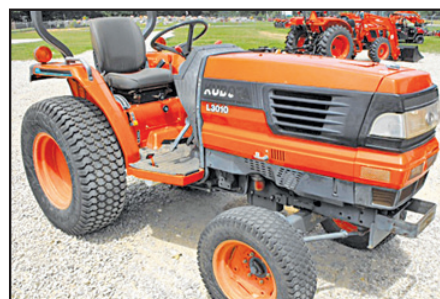
L3010 Kubota , 2wd, only 1574 hrs. shuttle trans., Original and nice! $7,500