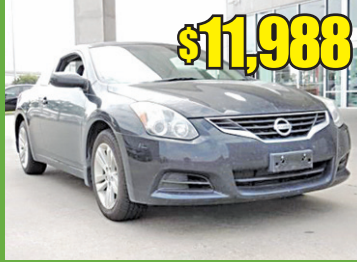
$11,988 '11 Nissan Altima 2.5S #U1491, 2 Dr. Coupe, Alloys, Sunroof, CD