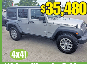
$35,480 '14 Jeep Wrangler Rubicon #U1477, Super Sharp 4x4!