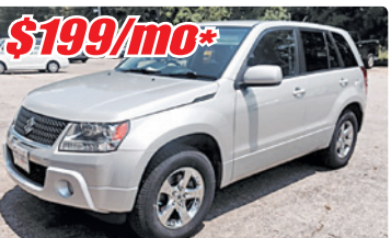
$199/mo* '11 Suzuki Grand Vitara #C140725D, Premium, Warranty