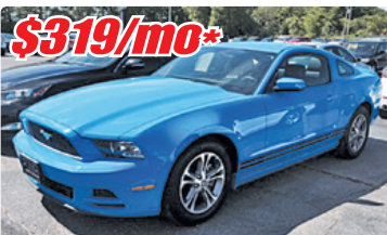
$319/mo* '14 Ford Mustang #P1515, Auto, Leather