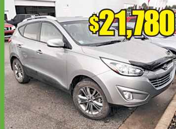
$21,780 '14 Hyundai Tucson Limited #15N5701A, Leather, Sport Wheels, Backup Camera, 30K Miles