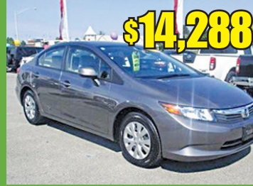
$14,288 '12 Honda Civic LX #U1456, 4 Dr., Only 48K Miles