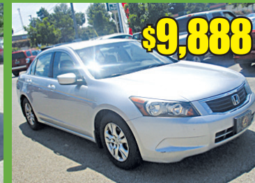
$9,888 '08 Honda Accord LX #15N5737A, Auto, All Pwr., Value Price