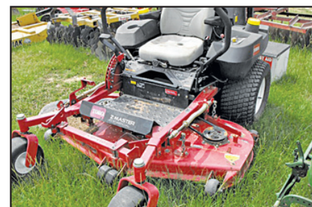
Toro Commercial Diesel Zero Turn with 1,628 hrs. $4,950