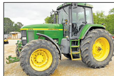
7800 John Deere , 4x4, Cab/Air, 10,370 hrs. $32,500