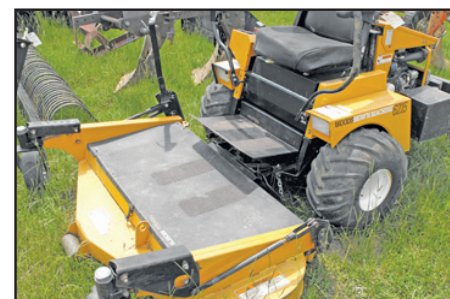
6215 Woods front deck mower, Kubota diesel, 1,012 hrs. mows and works good $3,950