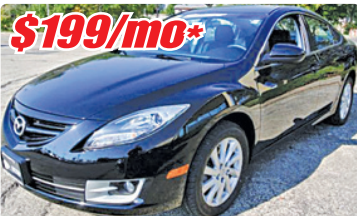
$199/mo* '11 Mazda 6 #P1469, Very Low Miles