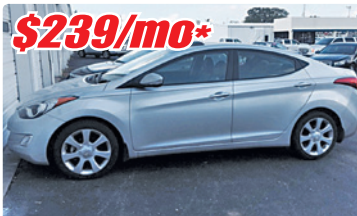
$239/mo* '13 Hyundai Elantra LTD #G150667A, Leather, Sunroof