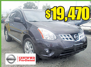
$19,470 '11 Nissan Rogue SV #15N5650A, Local Trade, Only 15K Miles