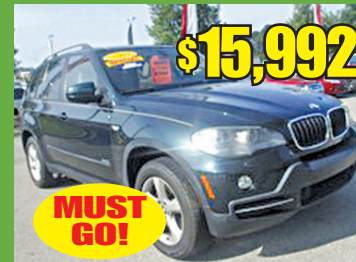
$15,992 '07 BMW X5 #U1400A, Navi, Leather, Moonroof, Pwr. Lift Gate