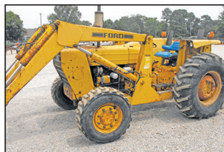
545A Ford , 4x4, 3pt., and loader, NO PTO OR BUCKET! Retired from our loader fleet, GOOD Tractor $6,950