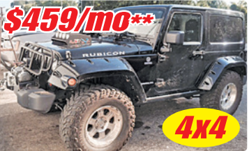
$459/mo** '13 Jeep Wrangler Rubicon #P1606, V6, Bad To The Bone 4x4

*W.A.C., 75 Months, Taxes & Fees Down @ 2.90% APR. Doc fee not included. Negative equity will be added to the new loan. **W.A.C., 84 months, taxes and fees down @ 2.9%. Doc fee not included. Negative equity will be added to the new loan.