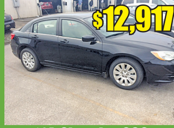
$12,917 '14 Chrysler 200 #U1457, Nice