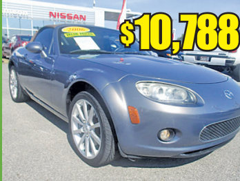
$10,788 '06 Mazda Miata MX-5 #15N5777A, Grand Touring, Alloys, Leather, Only 79K Miles