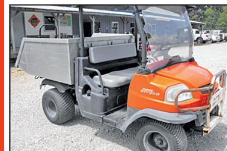
Kubota RTV900 , 4wd, hyd. dump with oversize bed $5,900