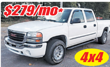
$279/mo* '07 GMC Sierra SLE #P1591, Crew Cab, Sweet 4x4