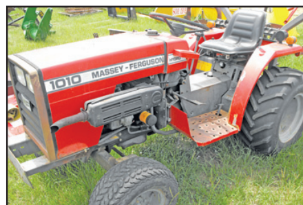
1010 Massey Ferguson , hydrostat trans., 2wd $3,500