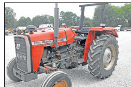
231 Massey Ferguson , 45 hp, diesel, power steering $4,950