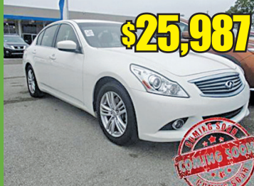
$25,987 '12 Infiniti G37 Journey #U1449, Leather, Nav., Moonroof