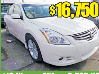
$16,750 '12 Nissan Altima 3.5SR V6 #15N5585A, Sunroof, Sport Wheels