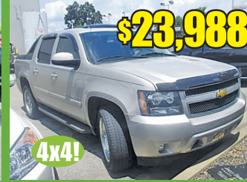
$23,988 '09 Chevy Avalanche LT #U1437B, Leather, Sunroof, Local Trade 4x4!