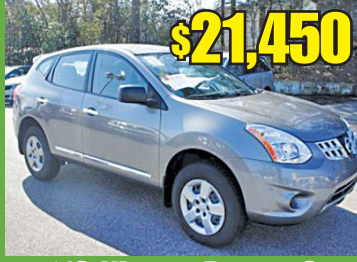
$21,450 '13 Nissan Rogue S #U1426, Alloys, Fog Lights, Only 12K Miles