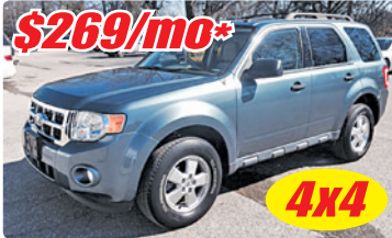
$269/mo* '11 Ford Escape XLT #P1488, 39K Miles, Leather 4x4