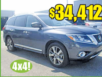
$34,412 '14 Nissan Pathfinder Platinum #U1487, FULLY LOADED, 22K Miles 4x4!