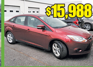
$15,988 '14 Ford Focus SE #U1452G, Alloys, CD, Only 1,400 Miles