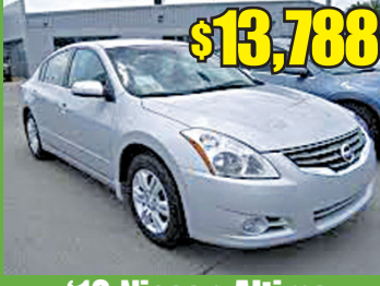
$13,788 '12 Nissan Altima #15N5744A, PW, PL, CD