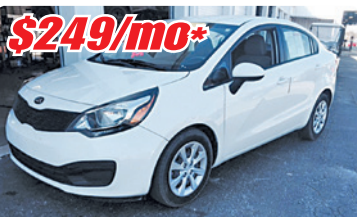
$249/mo* '14 Kia Rio LX #P1489, Like New Without The New Price!