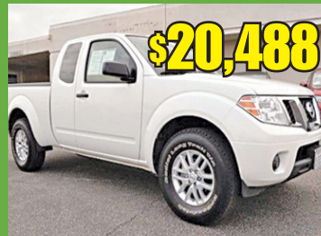
$20,488 '14 Nissan Frontier #15N5612A, King Cab, Only 8K Miles, Local