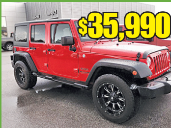
$35,990 '15 Jeep Wrangler Unlimited Sport #U1489A, Hard Top, A/C, Auto, Alloys, 12K Miles