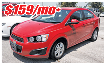
$159/mo* '12 Chevy Sonic #C150286A, Only 27K Miles, Alloys

+Qualified buyers, 84 months, $0 down @ 2.95% APR, Tax, Title & Doc Fee. Negative Equity Refinanced. All rebates to dealer. Offers do not combine.