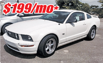
$199/mo* '07 Ford Mustang GT #C150459A, V8 & Fast