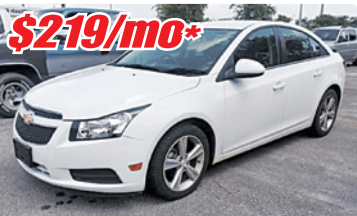
$219/mo* '12 Chevy Cruze 2LT #C150297B, Leather & Very Sharp