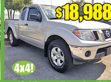
$18,988 '10 Nissan Frontier SE #U1490A, King Cab, All Pwr., 44K Miles 4x4!