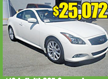
$25,072 '12 Infiniti G37 Coupe Journey #U1469, Luxury Sports Car, Must See!