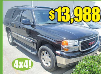
$13,988 '06 GMC Yukon SLT #15N5777H, Moonroof, Heated Leather, 3rd Row 4x4!