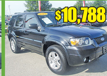
$10,788 '07 Ford Escape LTD #15N5422B, Leather, V6, Moonroof