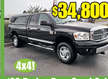
$34,800 '09 Dodge Ram Quad Cab #U1488A, 6.7L Cummins Turbo Diesel, Only 39K Miles 4x4!