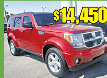
$14,450 '10 Dodge Nitro SE #15N5722B, CD, Alloys, Only 70K Miles