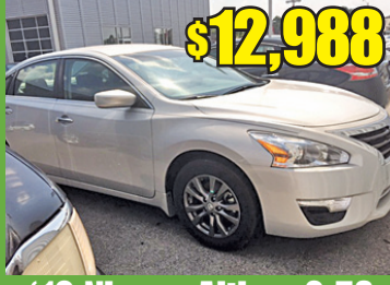
$12,988 '10 Nissan Altima 2.5S #14N4753A, PW, PL, CD, 63K Miles