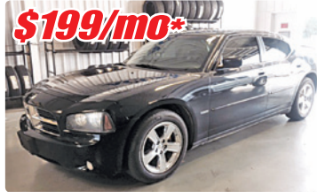
$199/mo* '07 Dodge Charger R/T #C150584A, Sunroof, CLean