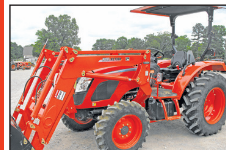
RX6620 Kioti , 66hp, 4x4, only 17 hrs., canopy, self-leveling QA loader, Warranty remaining! $27,900