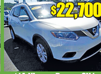
$22,700 '14 Nissan Rogue SV1 #15N5243A, Alloys, Backup Camera, Only 18K Miles