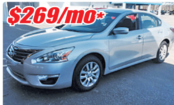
$269/mo* '14 Nissan Altima SE #P1486, Only 11K Miles