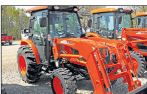
NX5510 55hp, cab/air or open station instock, 4x4, 4 year warranty, 100% financing available with approved credit!