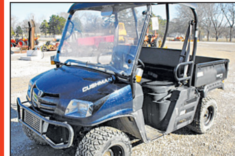
Cushman 1600XD UTV (same as Kiotti) 22hp, diesel, 4x4, good unit $5,500