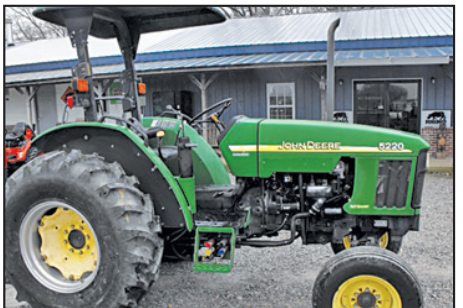
5220 John Deere 53hp, 2wd, new tires, dual remotes and joystick, nice $10,500