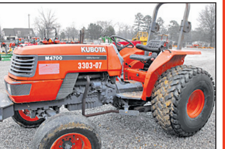
M4700 Kubota 51hp, 2wd, turf tires, runs, works good $5,850