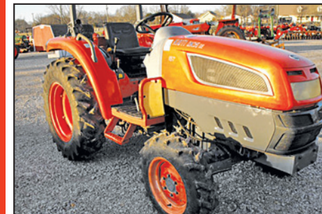
Kiotti DK35SE 38hp, 4x4, hst., single remote, 400 hrs. $7,950

All Types Of Equipment, New And Used, Call For More Information!