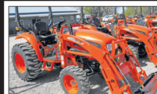
CK30 Kioti gear or hst. instock, 4x4, 30hp., FREE Loader! or 0% financing