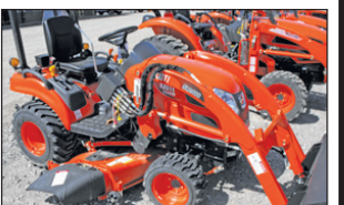
CS2410 24hp, available with 5' mid mower and loader, standard 3pt hitch and 540 pto