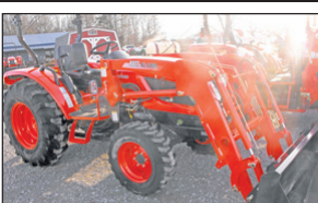
NX4510 New Teir 4 engines no instock, 4x4, 45hp, 0% financing or up to $3,000 cash rebate