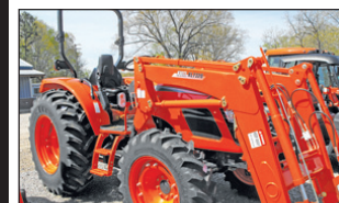
RX7320 73 hp, Cab/air or open station instock, 4x4, large cash rebates or 0% financing available.