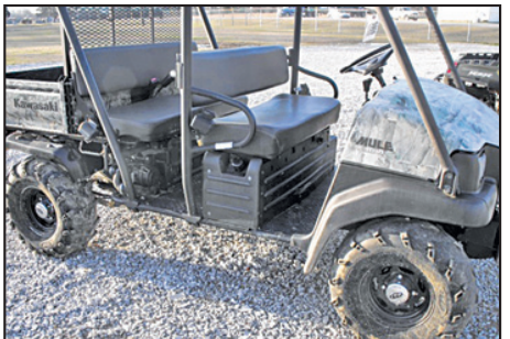
3010 Kawasaki Mule 4x4, 2 seater, gas, like new! only 140 hrs., camo w/winch $6,950