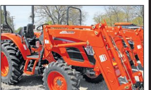
RX6620 66hp, open station or cab/air instock, 4x4, 4 year warranty, 0% financing or cash rebate up to $3,600