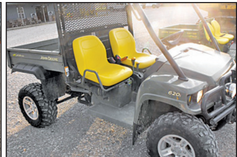
620I John Deere UTV 4x4, EFI gas, 640 hrs., very clean, runs, works the best! $6,500