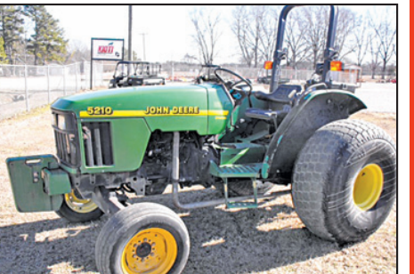
5210 John Deere diesel, remotes, turf tires, front weights, $7,850