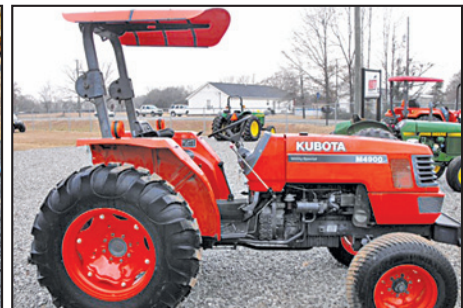
M4900 Kubota 54hp, 2wd, shuttle trans., single remote, $8,950