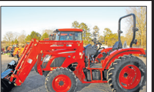
RX6620 cab/air or open station models instock, 66hp, 4x4, self-leveling loader, 0% financing or up to $3,600 cash rebate