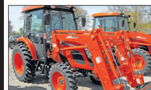
NX5010 50hp, 4x4, 4 year warranty, QA loader with QA bucket! 0% financing or up to $3,000 cash rebate