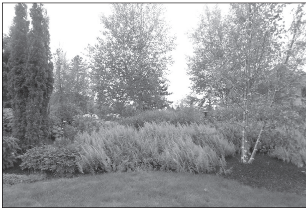
Some of the beautiful trees at Boothbay Garden Club.

This year's theme featured a riot of color with