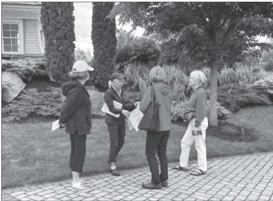
Learning about the plants at Boothbay Country Club.