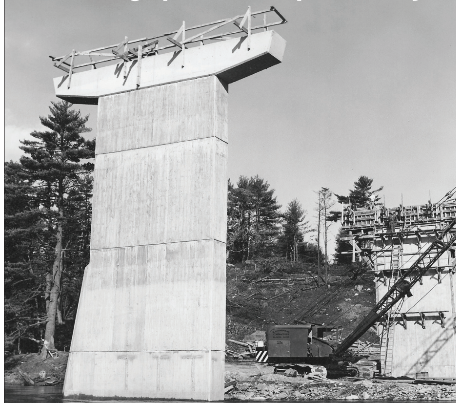
Before the Auburn and Lewiston Turnpike Exits opened in December of 1955, H.W. Hinman, Inc. of North Anson took charge of building the Androscoggin River Bridge.

Thank you, Lewiston/Auburn, for being a true high point in Turnpike history.