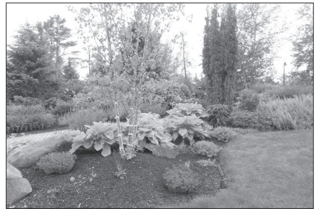
One of the pretty flower beds with trees in the background.

fuchsia impatiens as the main star. The beds also featured dusty miller.