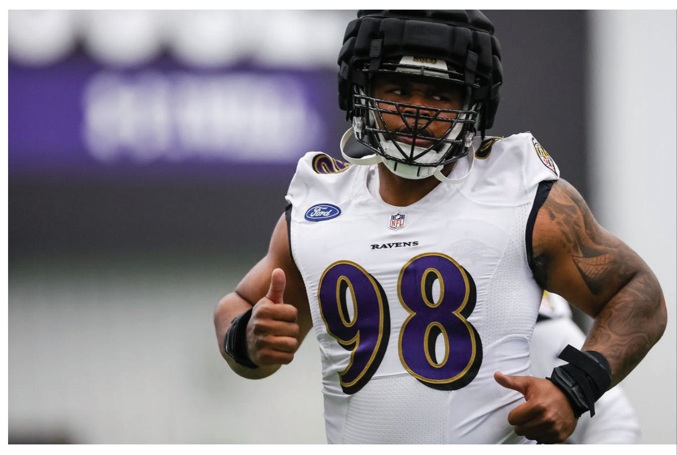
Travis Jones