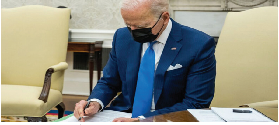
President Biden signs $750 billion Inflation Reduction Act into law Tuesday, August 16, 2022.

Phone: 410-366-3900- www.baltimoretimes-online.com