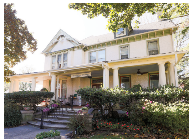
Guests who come to stay at the Magnolia House Inn can simply relax or get married in The Wedding Chapel.

The Magnolia House Inn and The Wedding Chapel are located at 232 S. Armistead Ave. in Hampton, Va. Military and AAA discounts are offered on guest room stays. Visit www.MagHouseHampton.com to learn more about the Magnolia House Inn. Direct booking can be made through the website, or by calling 757-722-2888. Learn more about the wedding chapel via www.VirginiaWeddingChapel.com .