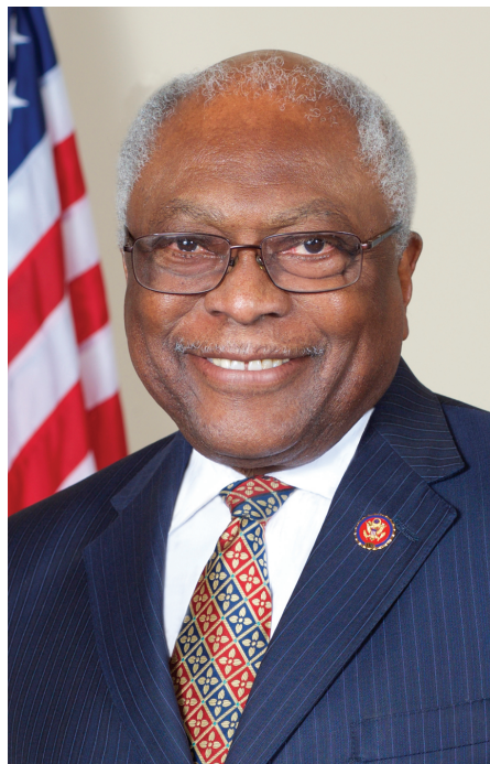
Congressman James E. Clyburn (D-SC), House Majority Whip