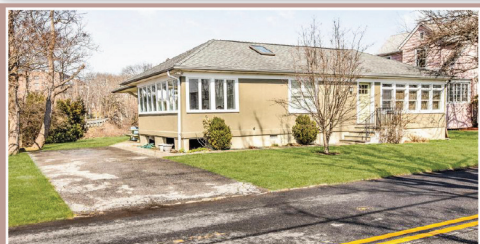
43 Harbor Lane UNDER CONTRACT