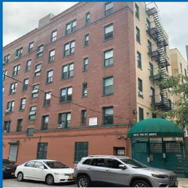
530 E 159th St #38, Bronx, NY Cooperative $159,000