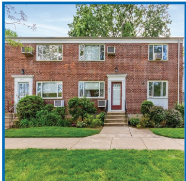
211-21 18th Ave #178, Bayside, NY 11360 Cooperative - $420,000