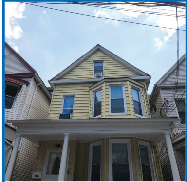
2664 Briggs Ave, Bronx, NY Single-Family $670,000