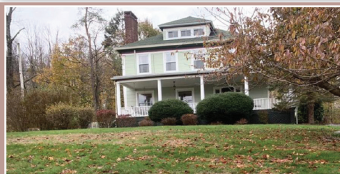
237 Oakland Ave Monroe NY $899,000

WANT TO KNOW WHAT YOUR HOME IS WORTH? LOOKING TO RENT OR NEED A TENANT? CALL FOR A FREE CONSULTATION!