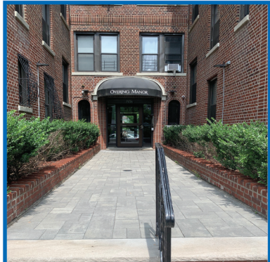
1506 Overing St #3B, Bronx Cooperative $140,000