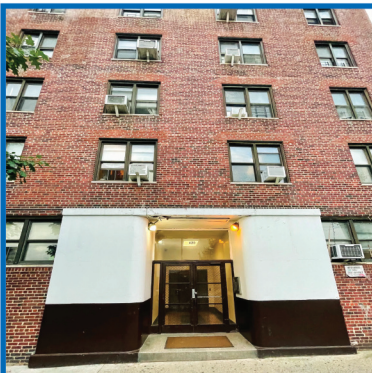
420 W 206th St #1J, NY, NY Cooperative $395,000