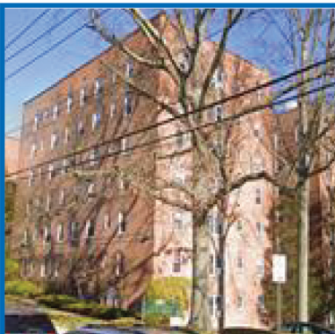
70 Locust Avenue Unit#612B, New Rochelle, NY 10801 Cooperative - $155,000