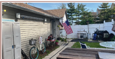
57 Pennyfield Camp $379,000