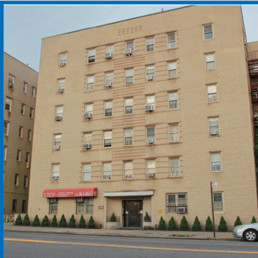
2190 Boston Road #2E, Bronx Cooperative $149,999