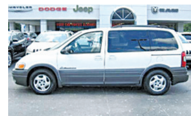
Stk# 7659B 2004 PONTIAC MONTANA A Bargain