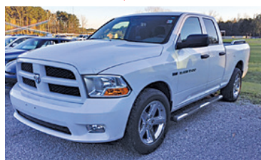
Stk# 7951B 2012 DODGE RAM 1500 Crew Cab, Hemi, Chrome Wheels