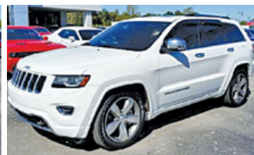
Stk# 760 2014 JEEP GRAND CHEROKEE Overland Edition