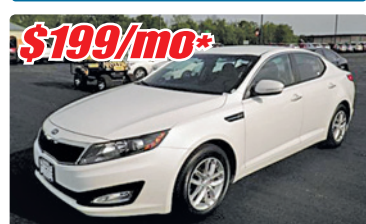
$199/mo* '12 Kia Optima LX #C150378A, Local Trade