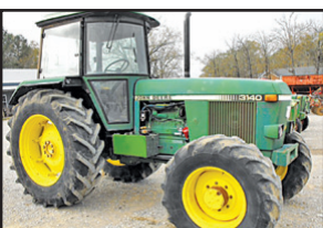
3140 John Deere 95 hp, C/A, 4x4, mechanically good but ruff, $CALL