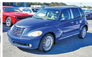
Stk# 764 2008 CHRYSLER PT CRUISER LMTD Alloys, Leather