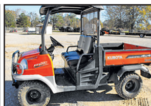
Kubota RTV 900XT 2012 model, 4x4, diesel, very clean $6,650