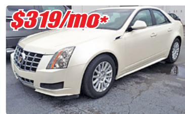
'13 Cadillac CTS Luxury #C150822A, Leather, Sunroof, Heated Seats, Low Miles