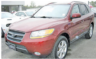
Stk# 757 2008 HYUNDAI SANTA FE Auto, PW, PL, Clean