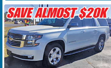
SAVE ALMOST $20K '15 Chevy Suburban LTZ #G150773A, Leather, Dual DVD, Navi, Roof, Too Much To List!