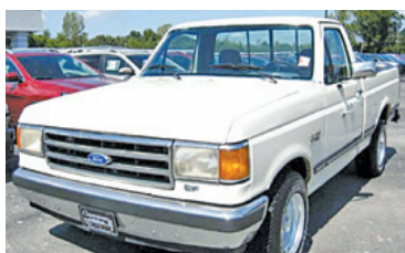
Stk# 747 1991 FORD F150 89K Miles, Auto, A Must See!