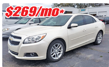
'13 Chevy Malibu LTZ Eco #C150485, Leather, Roof, Low Miles