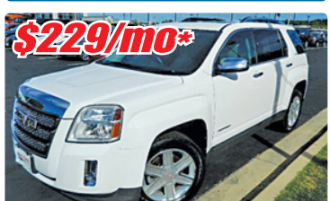
$229/mo* '10 GMC Terrain SLT #C150714D, Leather, Sunroof

*W.A.C., 75 Months, Taxes & Fees Down @ 2.90% APR. Doc fee not included. Negative equity will be added to the new loan. **W.A.C., 84 months, taxes and fees down @ 2.9%. Doc fee not included. Negative equity will be added to the new loan.