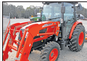
NX5510 Kioti 55hp., C/A, 4x4, loader, Like new, 22hrs. $32,900