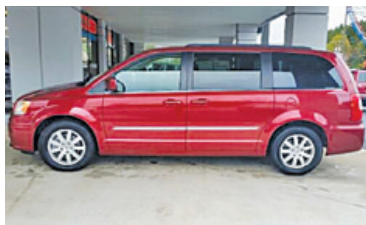
Stk# 765 2014 CHRYSLER TOWN & COUNTRY Touring Edition