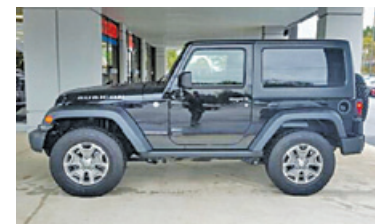
Stk# 768 2013 JEEP WRANGLER Rubicon, Nice!