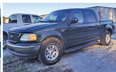
Stk# 784A 2002 FORD F150 Lariat, Crew Cab