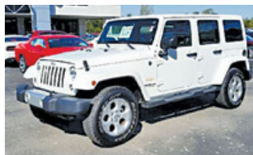
Stk# 7818A 2014 JEEP WRANGLER UNLMTD Sahara Edition