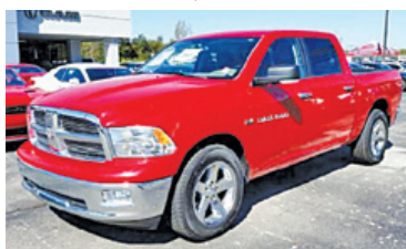
Stk# 753 2012 DODGE RAM 1500 SLT Crew Cab, Hemi