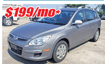
$199/mo* '11 Hyundai Elantra #P1567A, Touring GLS, Low Miles