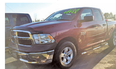
Stk# 6871A 2013 DODGE RAM 1500 4 Dr., Alloys, All Pwr.