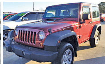
Stk# 7853B 2012 JEEP WRANGLER SPORT Hard Top, Sharp