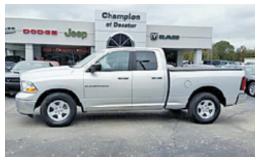
Stk# 7677A 2012 DODGE RAM 1500 SLT 4 Dr., All Pwr.