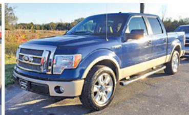
Stk# 7596A 2010 FORD F150 Crew Cab, Super Loaded