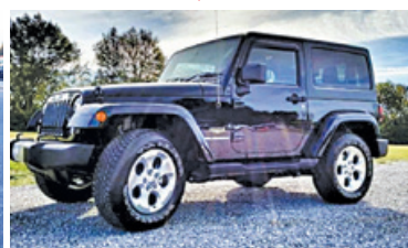
Stk# 7756A 2014 JEEP WRANGLER Shara Edition