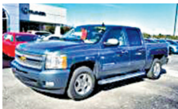
Stk# 783 2012 CHEVY SILVERADO LTZ Crew Cab, 42K Miles, Simply Beautiful