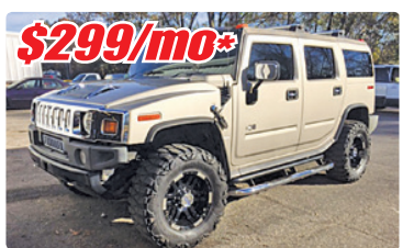
'05 Hummer H2 #C150725B, Leather, Sunroof, DVD, 3rd Row, Awesome!