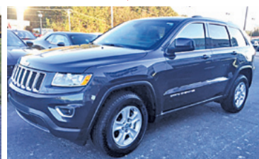
Stk# 7935A 2015 JEEP GRAND CHEROKEE Like New, Great Price