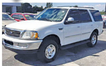
Stk# 722B 1998 FORD EXPEDITION All Pwr., Leather