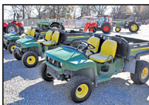
(3) John Deere gators 2012 models, very nice units, your choice $4,650