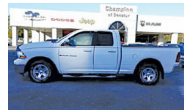
Stk# 7766A 2012 DODGE RAM 1500 4 Dr., Alloys, Loaded