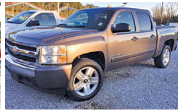
Stk# 7776A 2008 CHEVY SILVERADO Crew Cab, Alloys, PW, PL