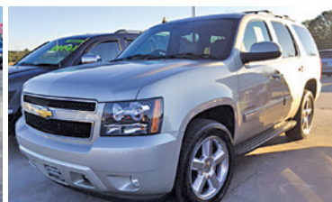
Stk# 7803A 2013 CHEVY TAHOE LT Chrome Wheels, All Pwr.