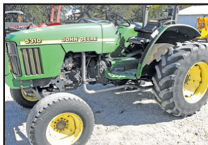
5310 John Deere 64 hp., like new rear tires, power reverser $8,950