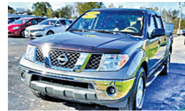
Stk# 7838A 2006 NISSAN FRONTIER SE Crew Cab, PW, PL, CD, Super Clean