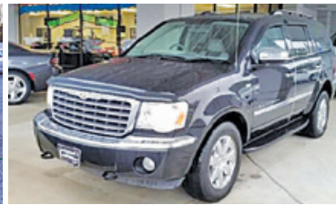
Stk# 7900A 2008 CHRYSLER ASPEN LIMITED Leather, Chrome Extras