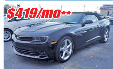
$419/mo** '14 Chevy Camaro SS 2LT #C150823A, Leather, Loaded, Only 3,800 Miles