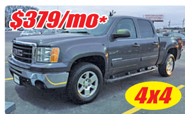
'11 GMC Sierra 1500 SLE #P1657, Crew Cab, Sharp!