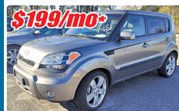
'11 Kia Soul Exclaim! #B150486B, Leather, Sunroof, New Tires