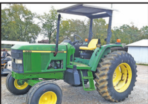
6410 John Deere 104 hp., starts, runs and works good. $11,900