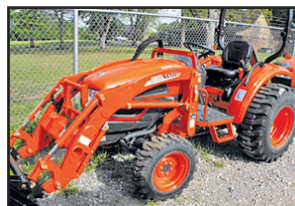
CK30 Kioti 30 hp., 4x4, QA loader, R4 tires, HST. transmission $17,900