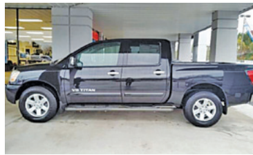
Stk# 769 2005 NISSAN TITAN Crew Cab, V8, Super Sharp!