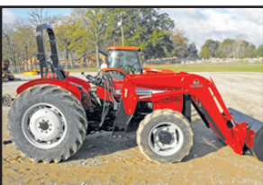
461 Massey Ferguson 75hp, 4x4, dual remotes, loader w/bucket and spear, new paint $17,500