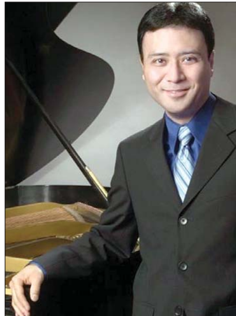
Internationally celebrated concert pianist Jon Nakamatsu performs the Season Opening concert for Steinway Society - The Bay Area on Sunday, September 11, 2016.