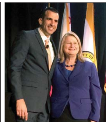
Mayor Liccardo with Vice Mayor Rose Herrera: The Mayor praised the Council and city workforce for rising above the acrimony of the past to work collaboratively.

SEE OUR LISTINGS OF LOCAL PLACES OF WORSHIP AND CLASSIFIED ADVERTISEMENTS INSIDE THE BACK COVER