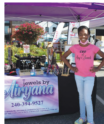
A young CEO sells her jewelry.