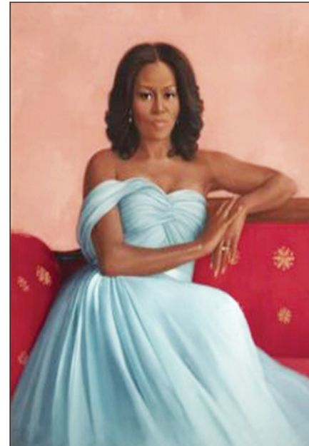
Former President Barack Obama and former first lady Michelle Obama's official White House portraits.

“Believe it or not, it is still a bit odd for me to stand in this historic space, see this big, beautiful painting staring back at me,” Michelle Obama remarked about the portraits.