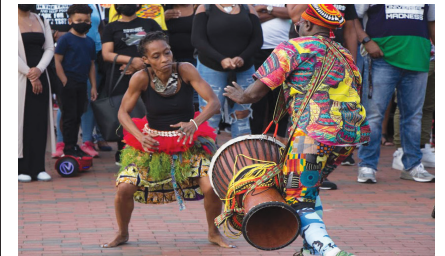
A dancer moves to the sound of drum beats.