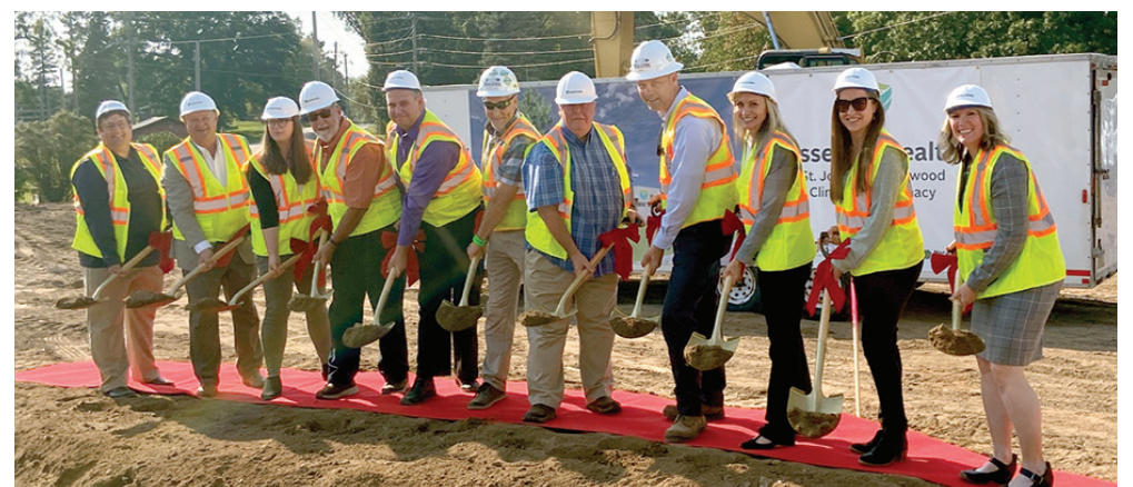
Essentia Health broke ground September 7 on a new clinic and pharmacy located at the intersection of Minnesota Highways 210 and 6, at the site of the former Thoroughbred Carpets.

Essentia recently held a groundbreaking in Deerwood, and will open their doors to Essentia Health – Deerwood Clinic and Pharmacy, in May 2023.