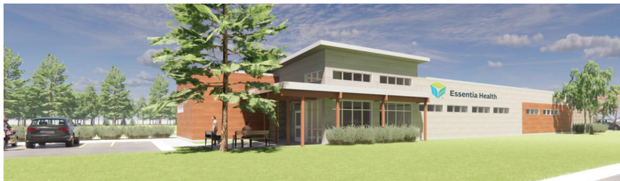
An artist's rendering of the new $5 million, 6,500-square-foot clinic and 700-square-foot pharmacy, which is scheduled to be completed in the spring of 2023.

The 700-foot pharmacy will feature a drive-through window. Patients can consult