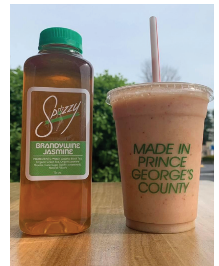
Organic tea and smoothies sold at Spizzy.

Visit https://drinkspizzy.com to learn more about Spizzy.