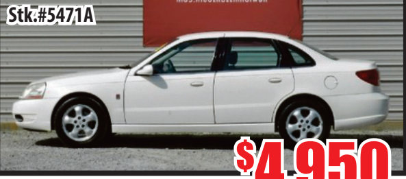
03 Saturn L200

#1 Nissan Dealer in Tennessee!* *RATED BY DEALERRATER