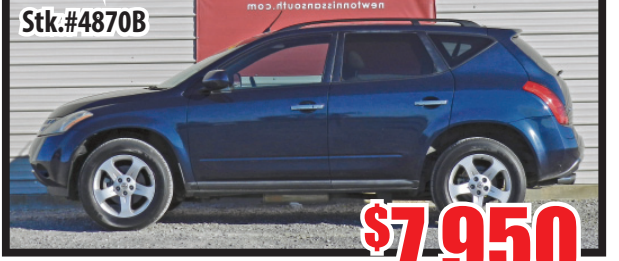
05 Nissan Murano