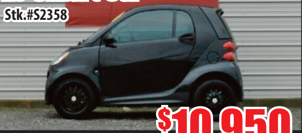
15 Smart Car