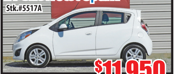
14 Chevrolet Spark