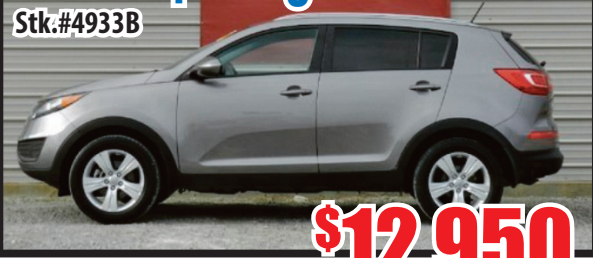
12 Kia Sportage