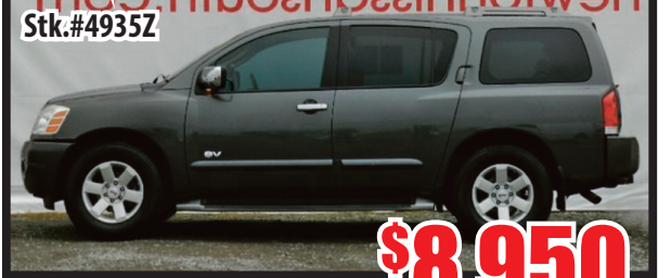
05 Nissan Armada