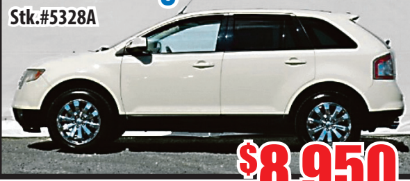
07 Ford Edge