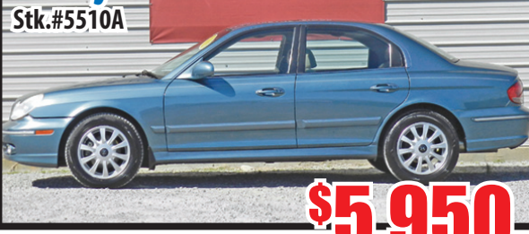
05 Hyundai Sonata