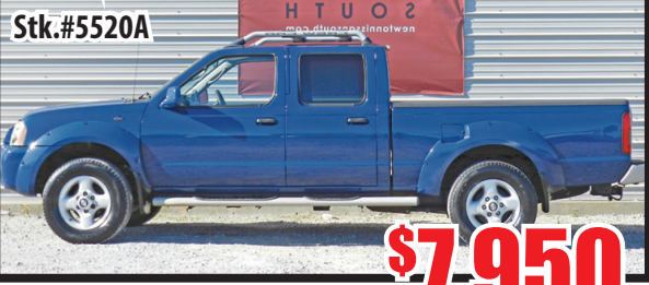
02 Nissan Frontier Crew Cab SE