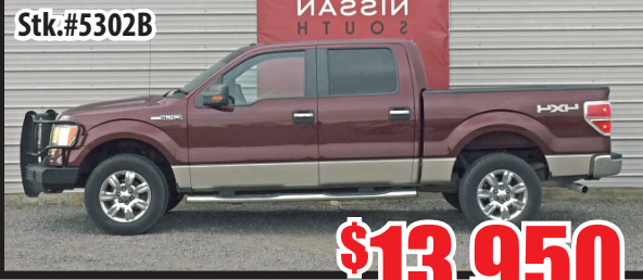
09 Ford F-150 XLT 4x4