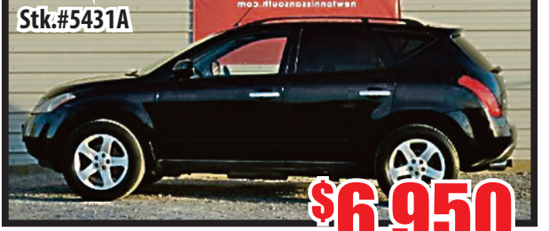
04 Nissan Murano