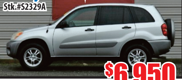
05 Toyota RAV4