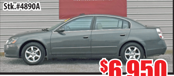
06 Nissan Altima