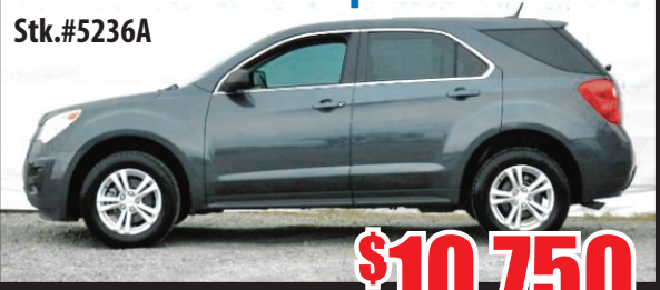
11 Chevrolet Equinox LS