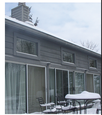
Schedule a free estimate by October 31, 2022 and receive a $300 discount on the purchase of either Gutter Topper or Heater Cap by mentioning this offer. Additional discounts are available for seniors and veterans.