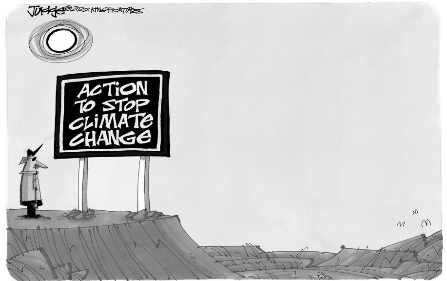
YET ANOTHER DROUGHT

Faces & Voices of Recovery has created a new Recovery Month website that will host all Recovery Month events and assets that make this celebration possible.