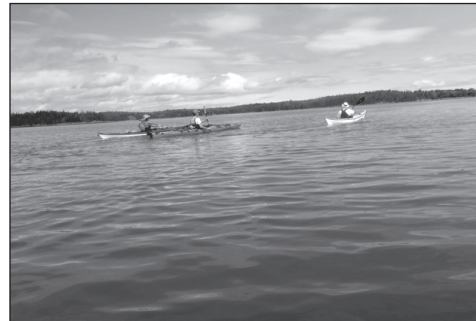
Paddlers cross Cobscook Bay towards Reversing Falls