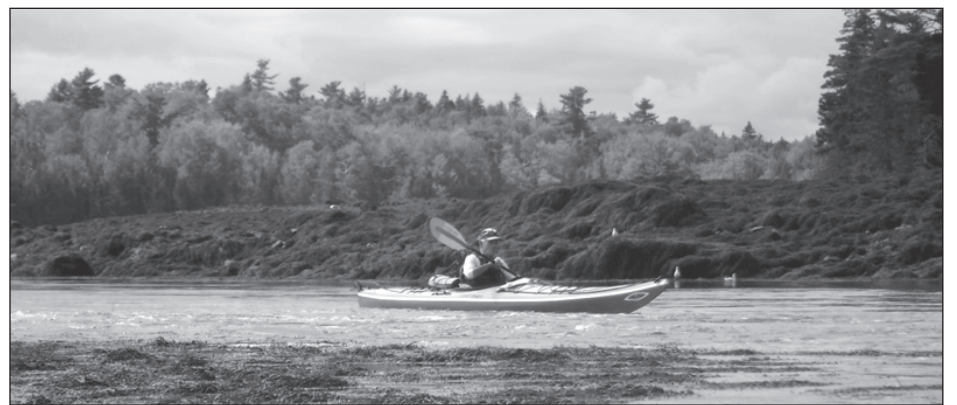
A kayaker cruises through rips leaving Bellier Cove

typical for Downeast sea kayaking: wonderful views, challenging seas, unpredictable weather, and fog seemingly always lurking nearby.