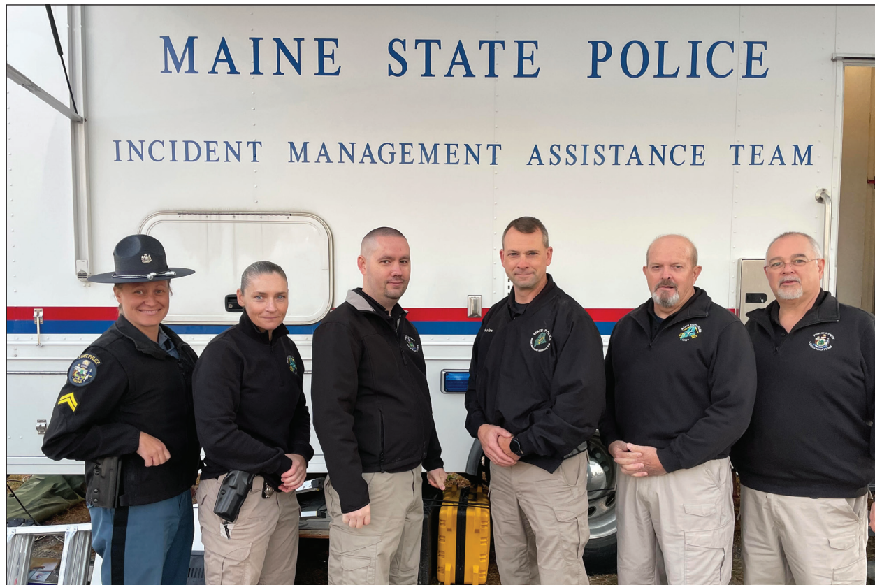
Maine State Police IMAT (Incident Management Assistance Team) were on hand at the Dempsey Challenge.