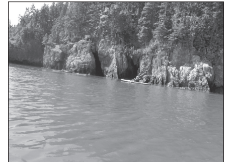
Kayakers encounter spectacular cliffs in outer Machias Bay