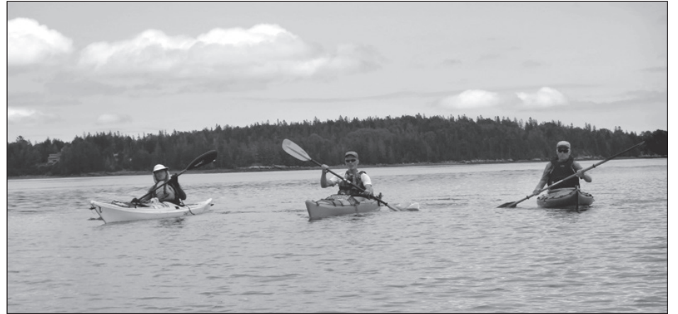
Three kayakers begin a trip on Cobscook Bay

On day one in Machias Bay, we embarked from a landing in Bucks Harbor and encountered superb conditions with clear skies, warm weather, and mild winds. Traveling along the rugged shoreline and around the Point of Maine was nothing short of glorious. Alas, on day two we were socked in with soupy fog. Our Machias Bay experience was