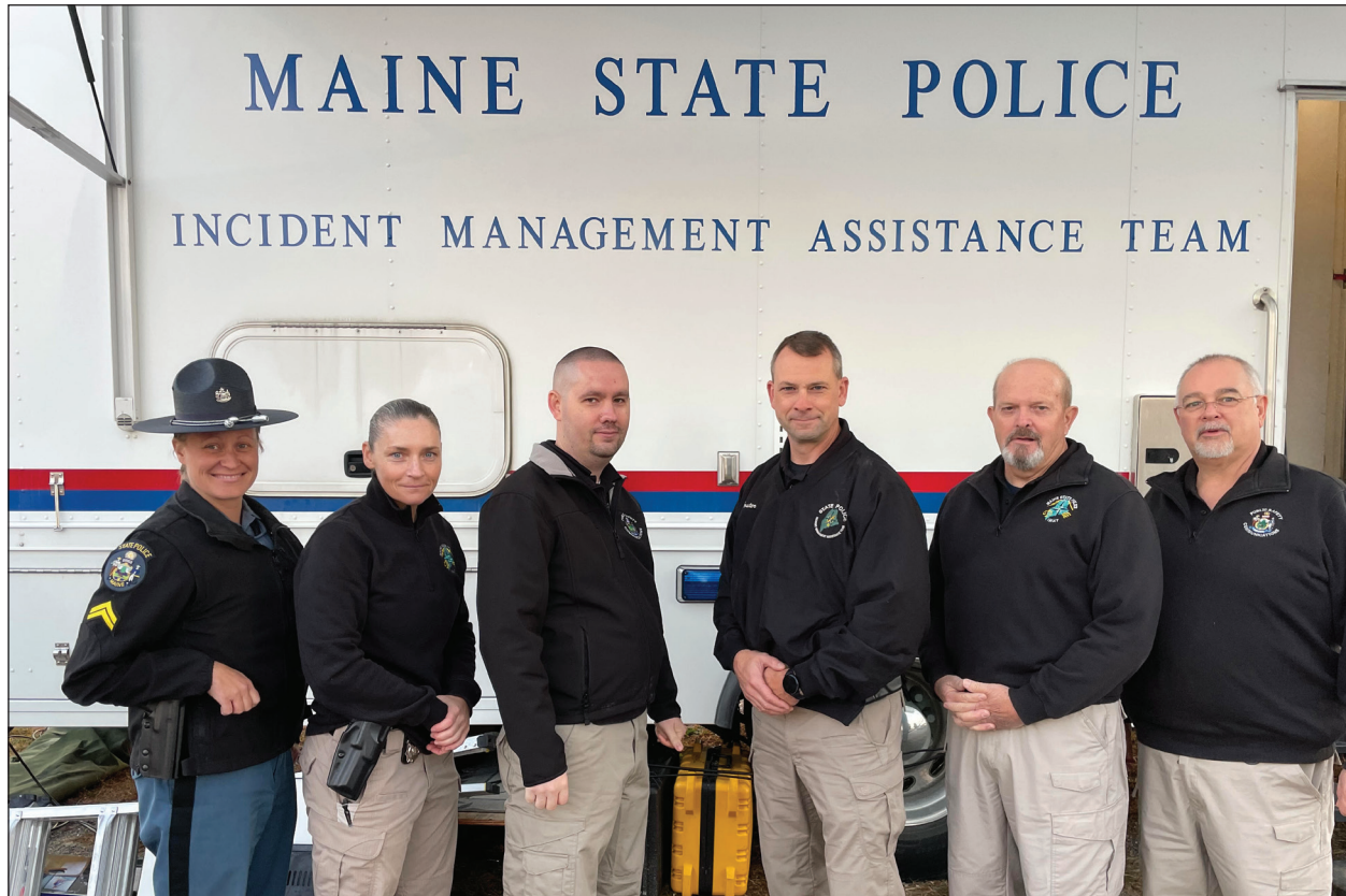
Maine State Police IMAT (Incident Management Assistance Team) were on hand at the Dempsey Challenge.