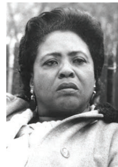
Fannie Lou Hamer

“The Fannie Lou Hamer Story” received Best Actor, Best Play, and Best Producer during the 2015 Atlanta Black Theater Festival, and the Best Solo Performance for the 2002 Audelco Viv Award. Hamer’s courage and compassion inspired Aimbaye to write the one-woman play, which follows Hamer’s rise from Jim Crow’s Mississippi to the halls of Congress as a powerful voice in the 1964 voter’s rights movement. She has performed this play for more than two decades. Aimbaye has also performed in small productions in the New York/New Jersey area and was cast in the role of Lucy for the first Black African American film depicting a slave revolt, “SANKOFA,” which was recently re-released on Netflix.