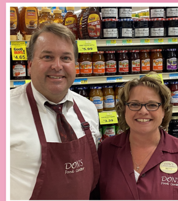
Win one of 2 $50 Pork Certificate from Don's Food Center