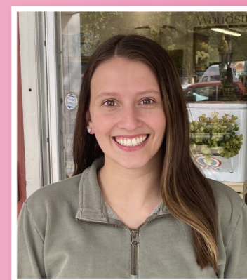
Win one of 2 $50 Pork Certificate from Woudstra's Meat Market