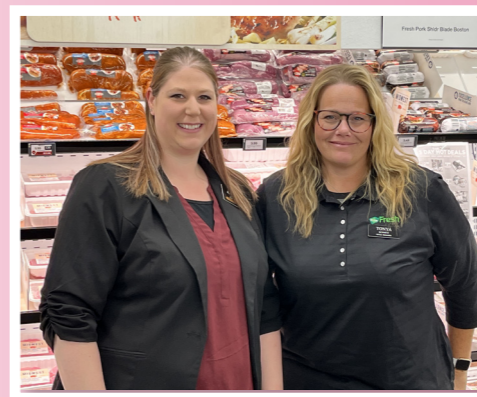
Win one of 2 $50 Pork Certificate from Dollar Fresh