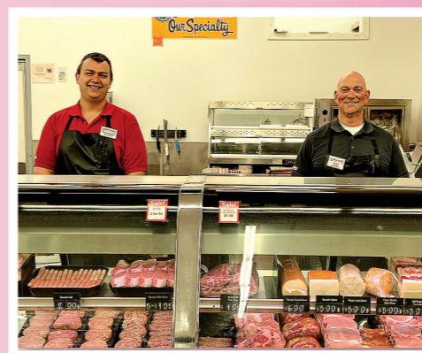
Win one of 2 $50 Pork Certificate from Fareway