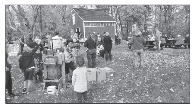
Kids turn the crank to make apple cider.

NORTH YAR-MOUTH, ME (October 6, 2022) -- After a two year hiatus, beautiful Skyline Farm, 95 The Lane, is the setting for North Yarmouth Historical Society's