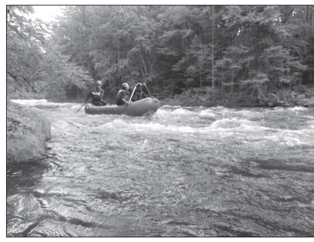
A rafting team navigates a rapid on the Magalloway