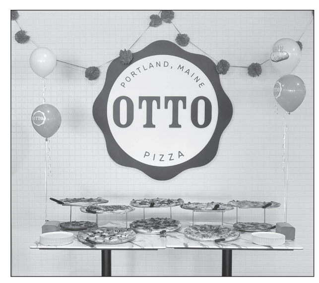
Display of delicious pizza for guests

AUBURN, ME (September 23, 2022) -- A ribbon-cutting event helped to celebrate the grand opening of Auburn's newest restaurant, Otto Pizza. The owners recently sat down with City of Auburn staff to close on a business loan used to open the 730 Center Street location. And today, the city – along with some special guests – helped