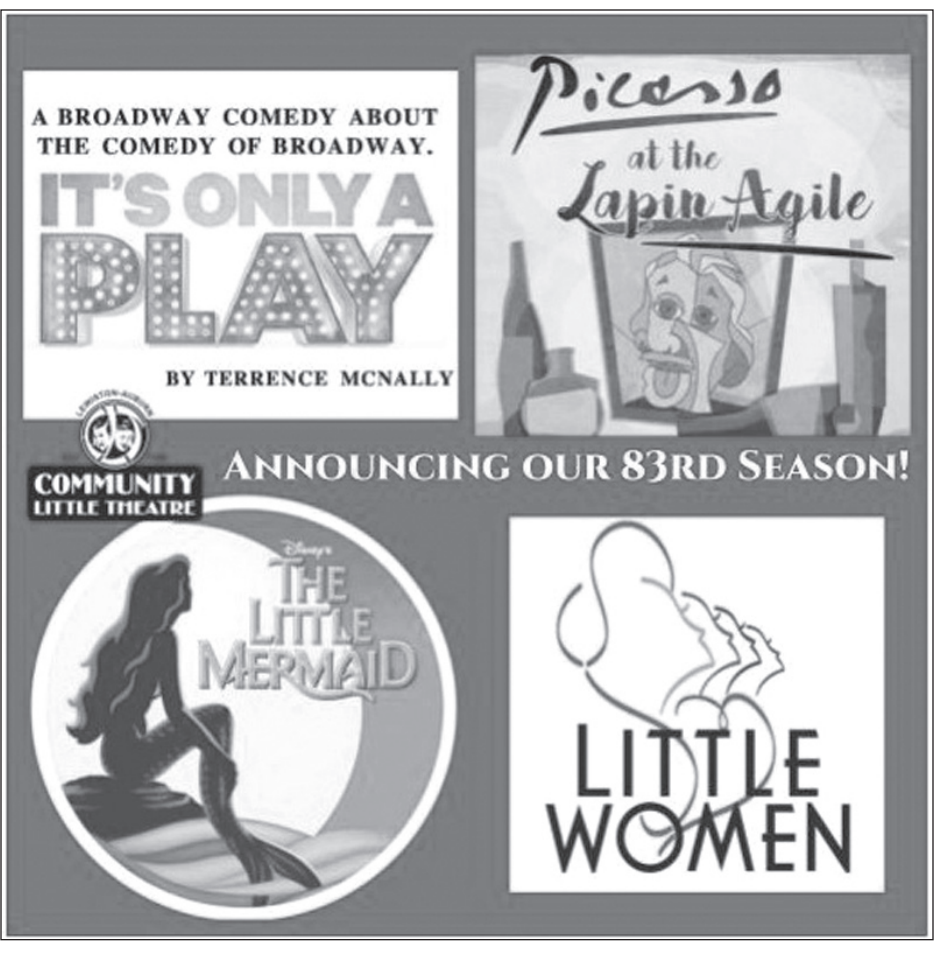
The four shows of CLT's 83rd Season.

AUBURN, ME (October 3, 2022) -- The L/A Community Little Theatre (CLT) will open its 83rd season in January with the critically acclaimed comedy It's Only a Play by Terrence McNally.