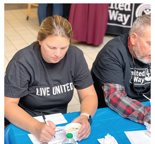
Recipe for success—judges used serious deductive powers to pick winners.