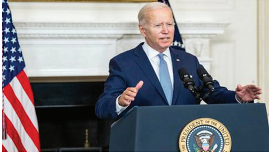
President Joe Biden

Fielded via an online opt-in panel from September 15-19 (with a margin of error of +/-3.1%), the survey revealed that 86% of Black voters supported President Biden's loan forgiveness plan, including 60% who "strongly supported" the policy.