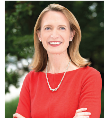
Brooke Lierman