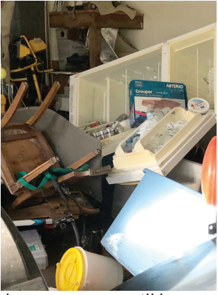
that no contents will be covered and is waiting to hear on exterior and interior repair of

"It took days to empty the garage and to empty the mega boxes (completely drenched) from the storage space under the house, turned couches and loveseat on sides to empty water - we had some volunteers to help empty the garage - wow they were amazing.