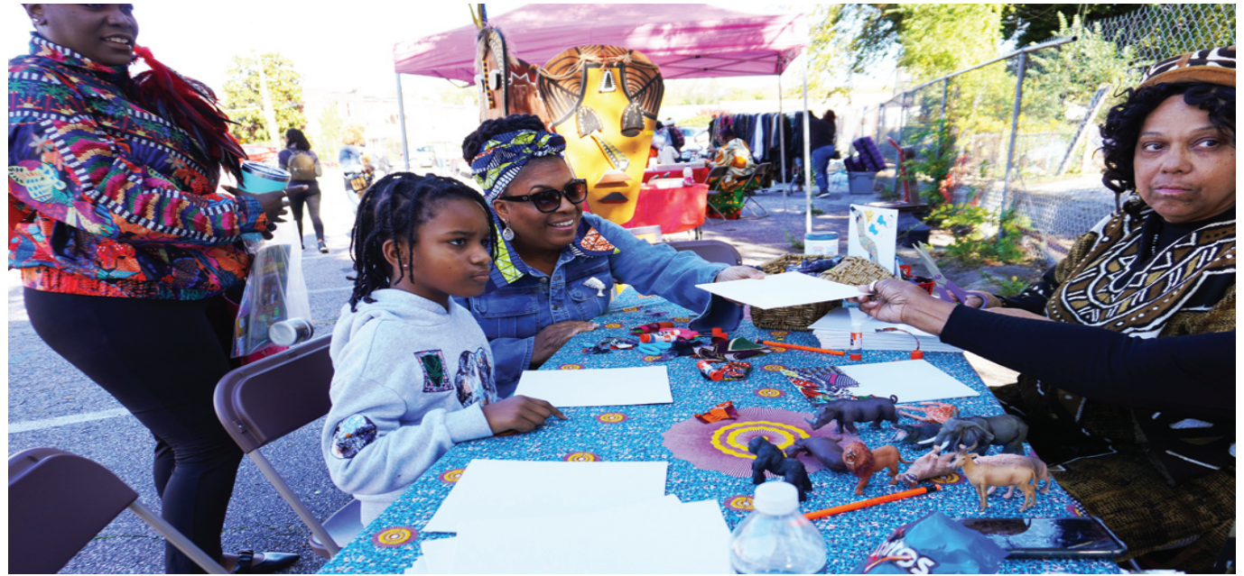
Children participated in table activities at the Sankofa Children's Museum of African Cultures, Inc festival, Saturday, Oct 29, 2022 in Park Heights.

Many children, teens, and adults think Africa is a country with lions, monkeys, and a jungle. Africa is a continent with 54 countries on it. It can absorb the U.S. three times. Some deny they are of African descent. They remain quite a