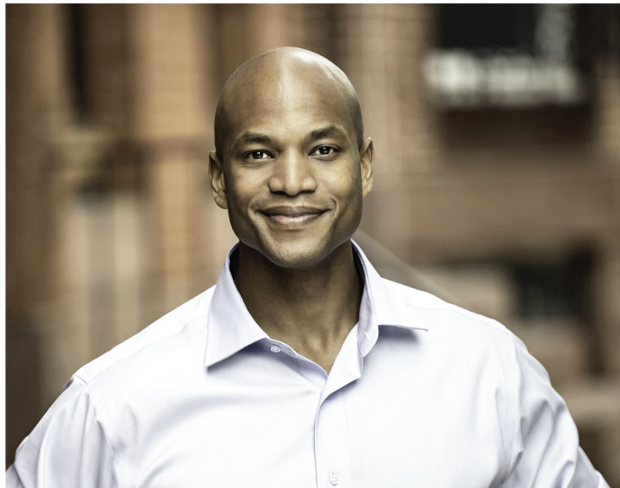
Wes Moore made history by becoming Maryland's first Black governor.

"And it's because you believed that I stand here humbled and ready to become