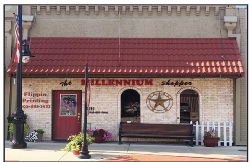
Flippin Printing located inside The Millennium Shopper at 115 Jefferson in Sulphur Springs.