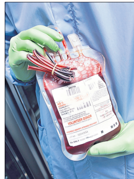
Donating blood can be a worthwhile effort for someone looking to make a difference.

Story courtesy of Metro Creative Connection