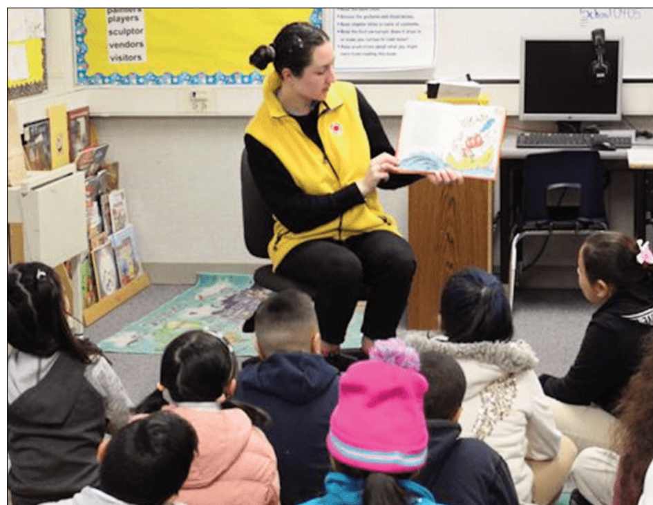
Alum Rock Union School District, which serves East San Jose families disproportionately impacted by the COVID-19 pandemic, is seeing test scores drop.

Evergreen School District saw a 0.7% increase in reading and writing scores and a less than 1% decrease in math scores across its 16 elementary and middle schools that serve more than 9,900 students. Campbell Union High School District had a 2.8% increase in reading and writing scores and