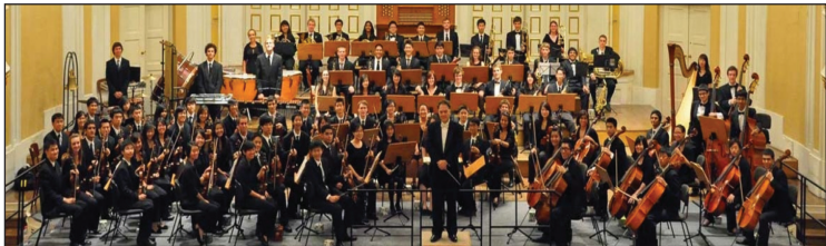
The San Jose Youth Symphony's Philharmonic Orchestra will present its 2022-23 Season Opener Concert on Saturday, Dec. 3, 2 p.m. at the California Theatre.

Continued from page 1 her first two years before joining the Philharmonic Orchestra last season.