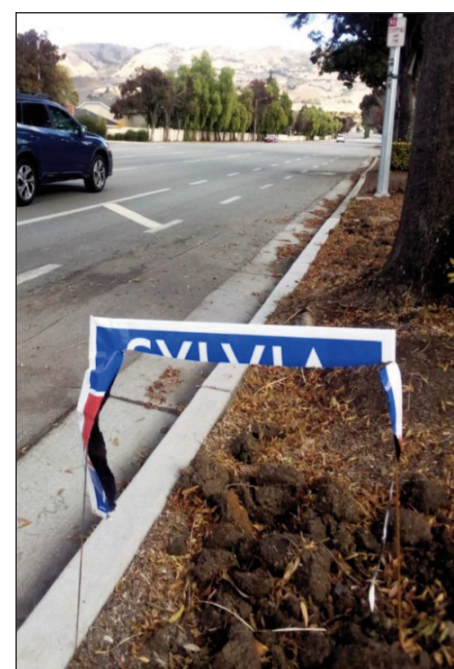
Political signs posted and one sign cut out along road.