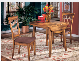
3PC Dropleaf Table Set