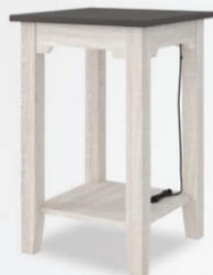
Assorted End Tables with USB Ports