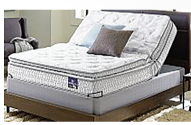
Queen Size Adjustable Bed Featuring Pillow Top Mattress