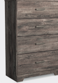
4 Drawer Chest