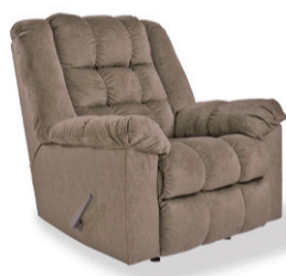
Power Rocker Recliner