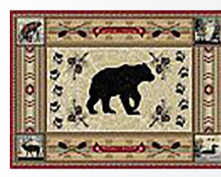
Rustic Room Size Rugs