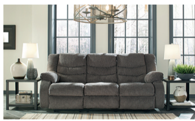
Ashley Reclining Sofa