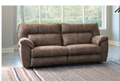
Power Reclining Sofa