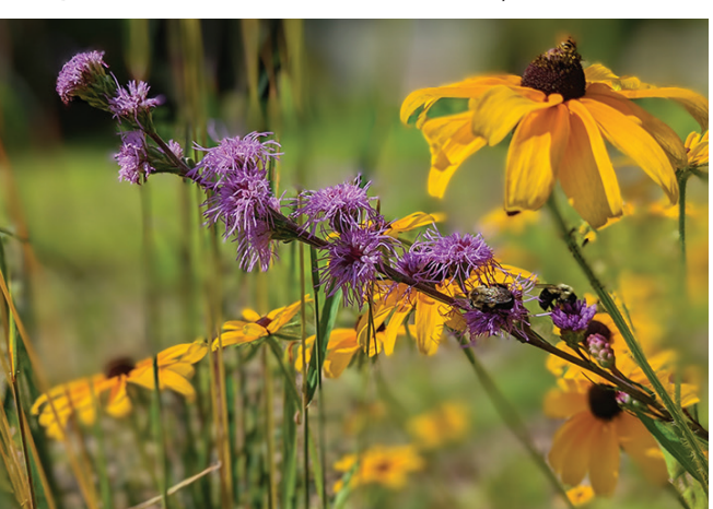
Second-place winner, Blazing Star with bees by Rick Meyer.

Lauer also reminds area residents to stay tuned for the 2023 Tree and Plant sale where you can create your pollinator oasis in your own backyard as a perfect place to snap next year's winning photo. Ordering will be available from January 1 to February 25, 2023 or until trees are sold out at www.cwswcd.org/ shop. Pick up of the order will be at the Crow Wing County Fairgrounds May 11-12, 2023 from 8 a.m. to 5 p.m.