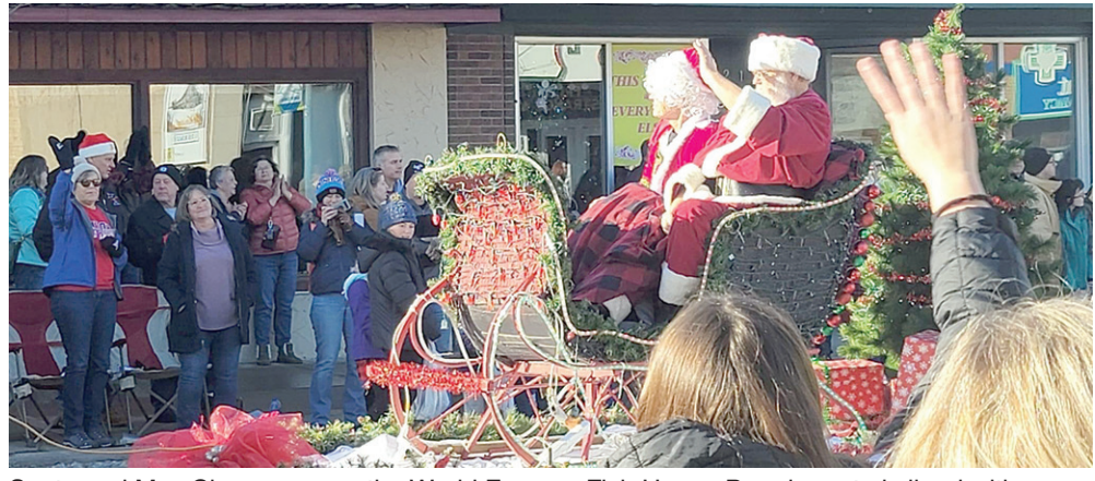
Santa and Mrs. Claus wave as the World Famous Fish House Parade route is lined with eager shoppers on Black Friday in Aitkin.