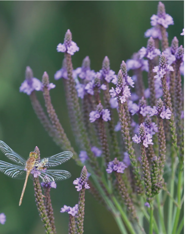
First-place winner, Blue Vervain with Dragonfly submitted by Courtney Neifert.

As the weather turns frigid we are treated to snapshots of warmer days.