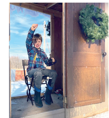
Left: Mille Lacs Energy's float entry was a keeper.

The Friday after Thanksgiving is anything but black in Aitkin, as colorful ping-pong balls indicating discounts are shot out to eager deal-seeking shoppers. And the street is filled with floats and candy.