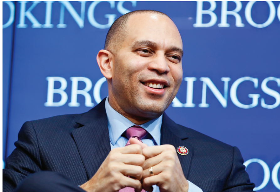
New York Rep. Hakeem Jeffries (D)

But most importantly, Jeffries's ascension into a leadership role as vets like House Speaker Nancy Pelosi and Majority Whip James Clyburn step aside sig-