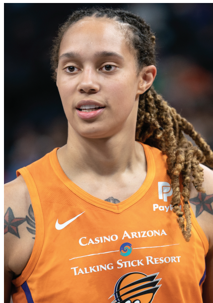
WNBA star Brittney Griner

Whelan has been imprisoned in Russia for nearly four years, and, recently, his family said they hadn't heard from him.