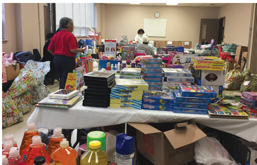
Volunteers prepare Christmas gifts to be wrapped for families.