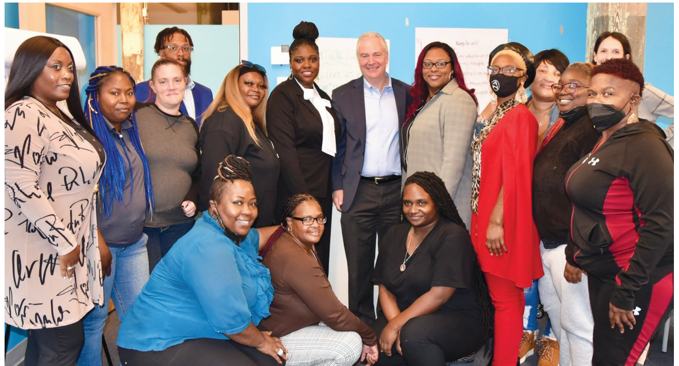
U.S. Senator Chris Van Hollen along with PIVOT program staff and participants.

Participants in PIVOT’s programs have an employment placement rate of 70 percent and a recidivism rate of less than 5 percent.