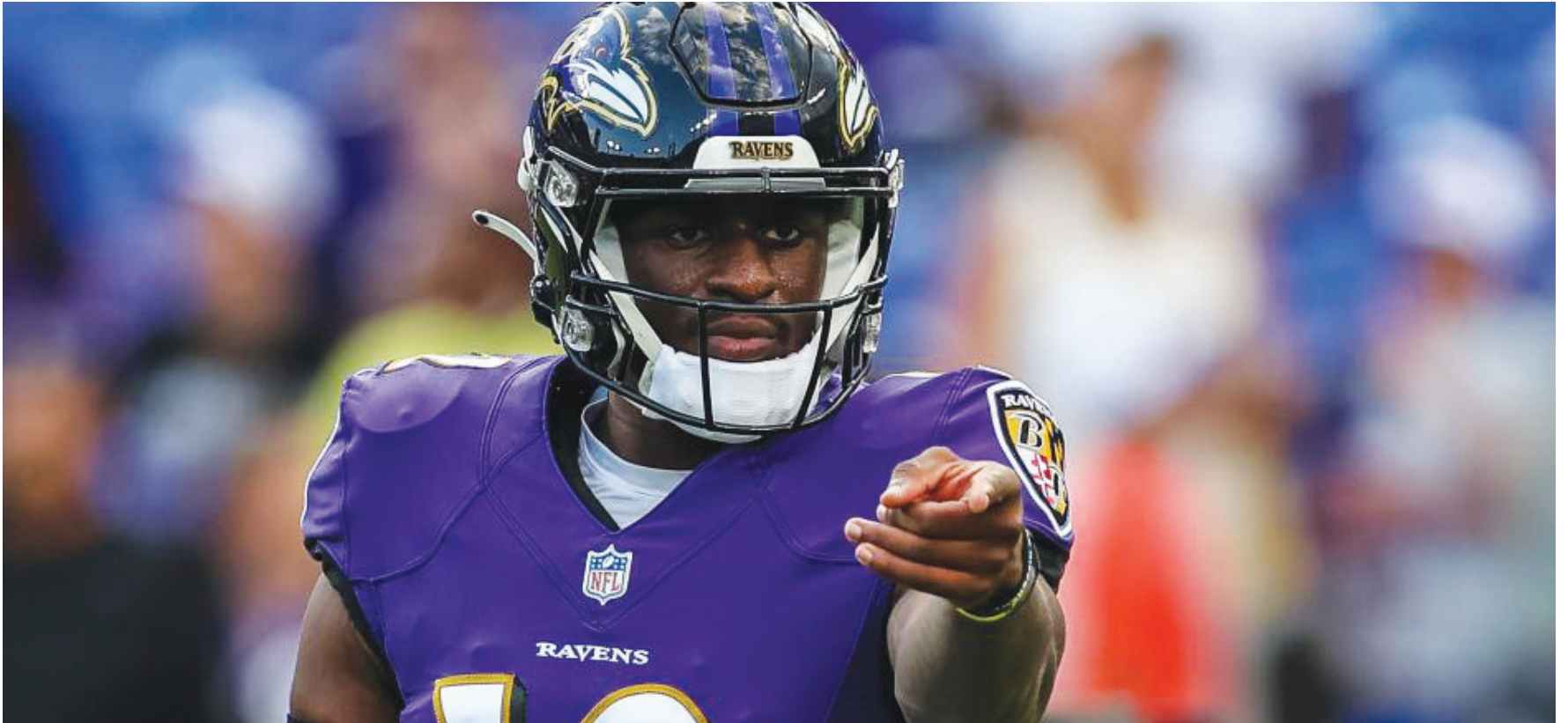
Anthony Brown