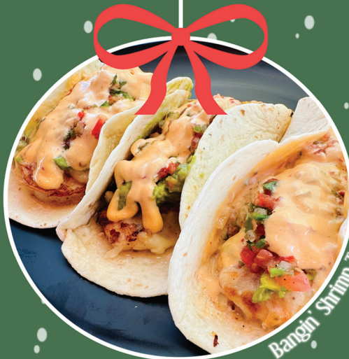
Bangin Shrimp Tacos