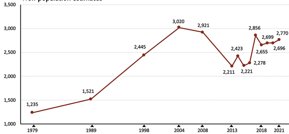
Wolf population estimates

To inform the wolf plan update, the DNR conducted a public opinion survey, consulted with technical experts and tribal staff, and convened a 20-member wolf advisory committee. Advisory committee members represented diverse perspectives including hunting and trapping, wolf advocacy and animal rights, livestock and agriculture, and other interests related to wolf conservation and management. The DNR's public engagement efforts for the plan update included input meetings, forums, online questionnaires and public review of a draft plan.