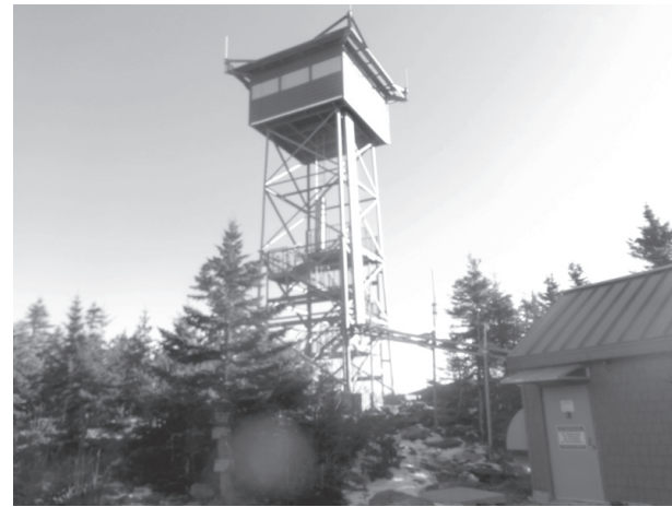
There is a new tower at the summit of Mount Blue