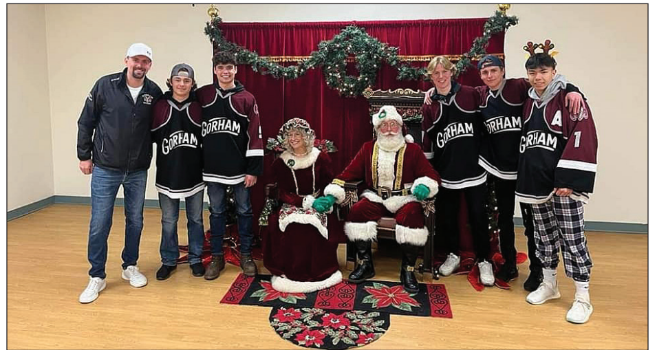
Gorham Hockey with Santa and Mrs. Claus