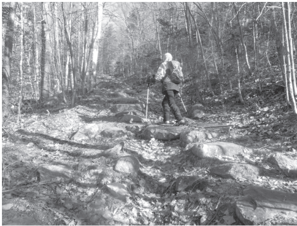
The beginning of the Mount Blue Trail was rocky but dry