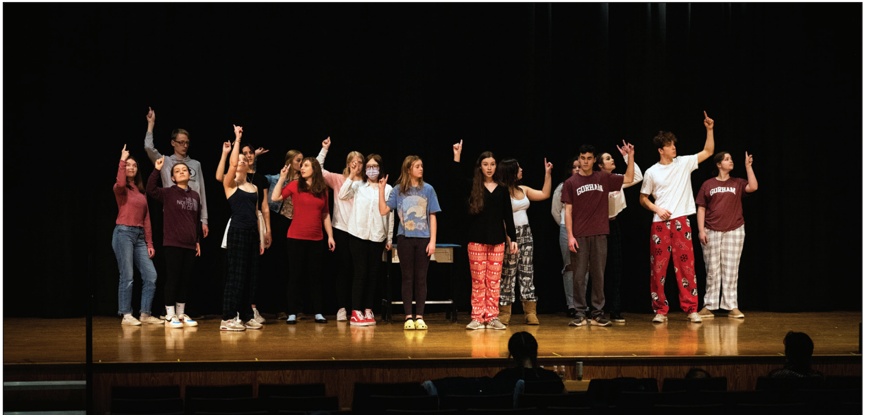
The cast of Mary Poppins at Gorham High School.