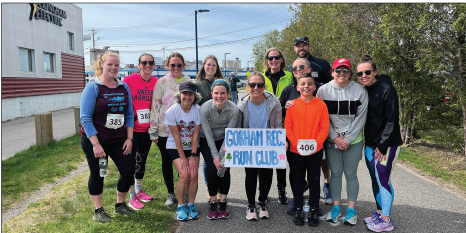
Couch to 5K