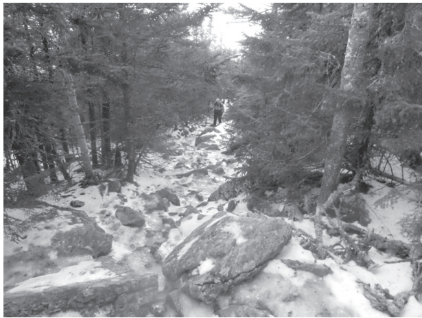
An icy trail is encountered high on Mount Blue