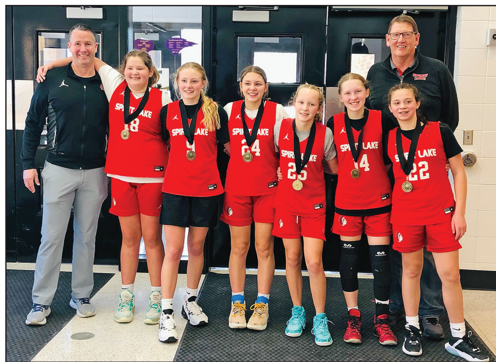
THE SPIRIT LAKE 7TH GRADE GIRLS BASKETBALL TEAM won the championship at the South O'Brien tournament on Saturday, January 7th. The team beat Rock Valley 19-11, South O'Brien 20-9, and Sheldon 26-7 on their way to the championship.

For any and all inquiries, please contact glenn@westobeer.com . For more information on West O Taproots, please visit https://westobeer.com/taproots .