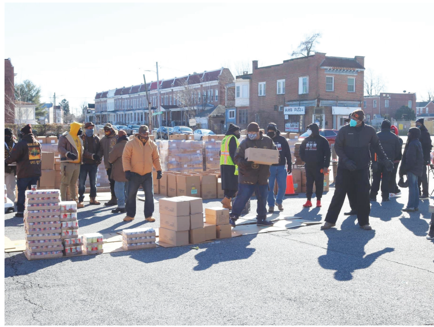
We OUR US provides food in the community.

A 24-hour "Stop The Beef Hotline" has allowed We Our Us to mediate hundreds of "beefs" or worsening conflicts in Baltimore City, according to Burton. There is no police involvement, although We Our Us