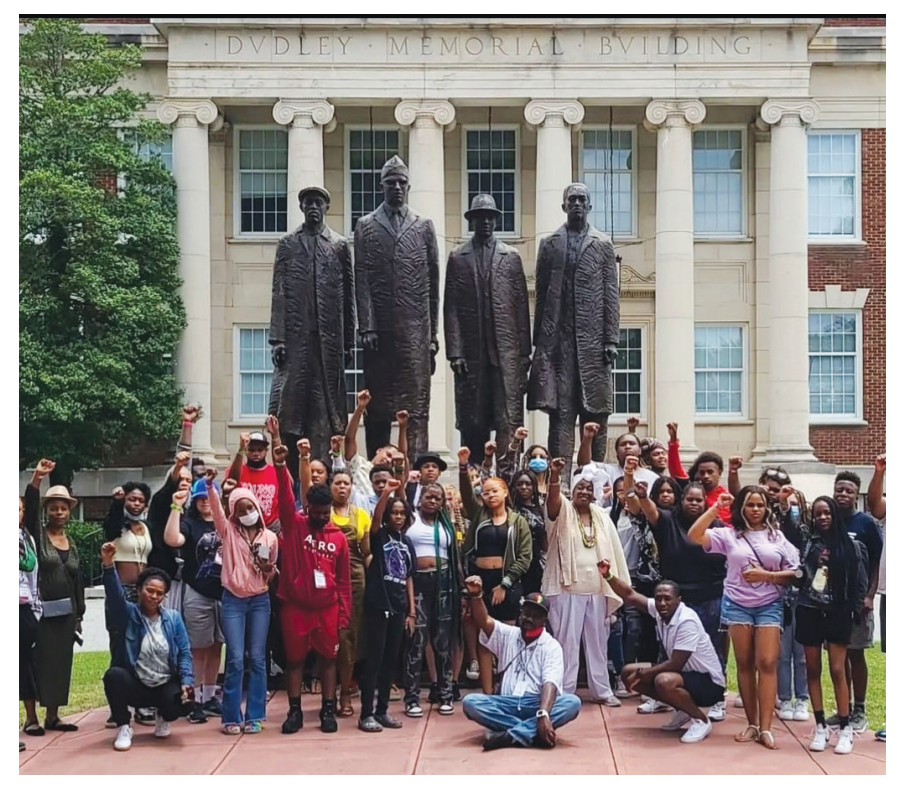
Participants of the first Freedom Rides Tour provided by the Teaching Artist Institute in partnership with TAI Tours raise their fists in the air in Little Rock Arkansas.

"Here in Baltimore, during the pandemic, we realized that housing was a major issue. Teaching Artist