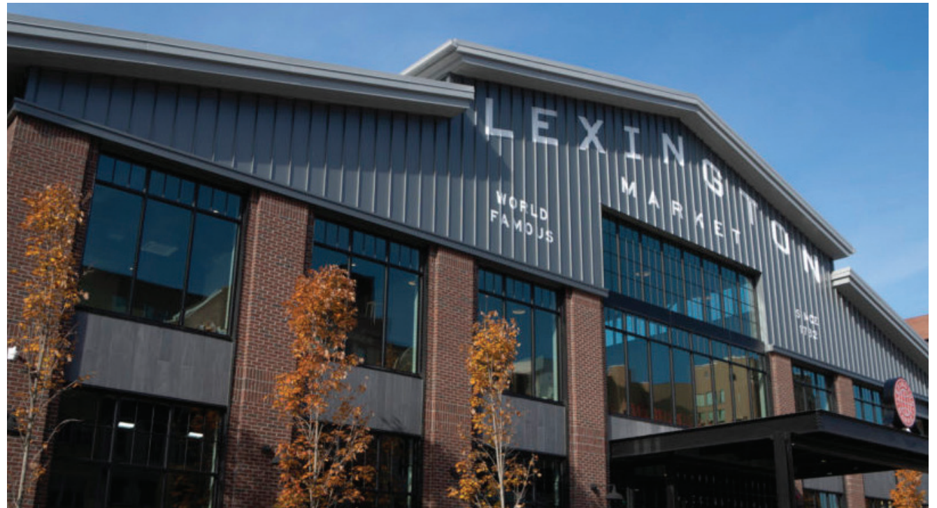
The newly remodeled Lexington Market.

Led by Baltimore Public Markets Corporation and Seawall Development, Lexington Market's revitalization includes funding from both the Maryland Department of General Services and the Maryland Department of Housing and Community Development. Between the two agencies, the state has invested