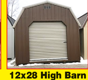
7x7 Roll Up Door, 1 Window 8 Foot Loft $7,355 Rent To Own $341