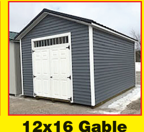
12x16 Gable 1 Window $5,536 Rent To Own $257/Month