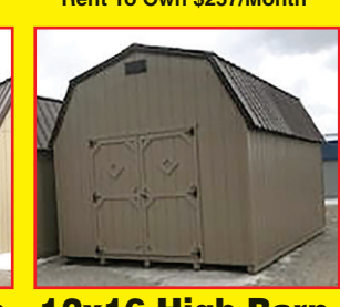
12x16 High Barn $4,475