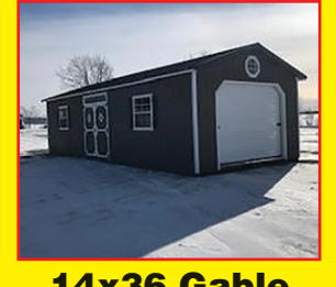
14x36 Gable 9x7 Roll Up Door, 4 Windows 6 Double Doors, 4 Ft. Loft $10,585 Rent To Own $491/month