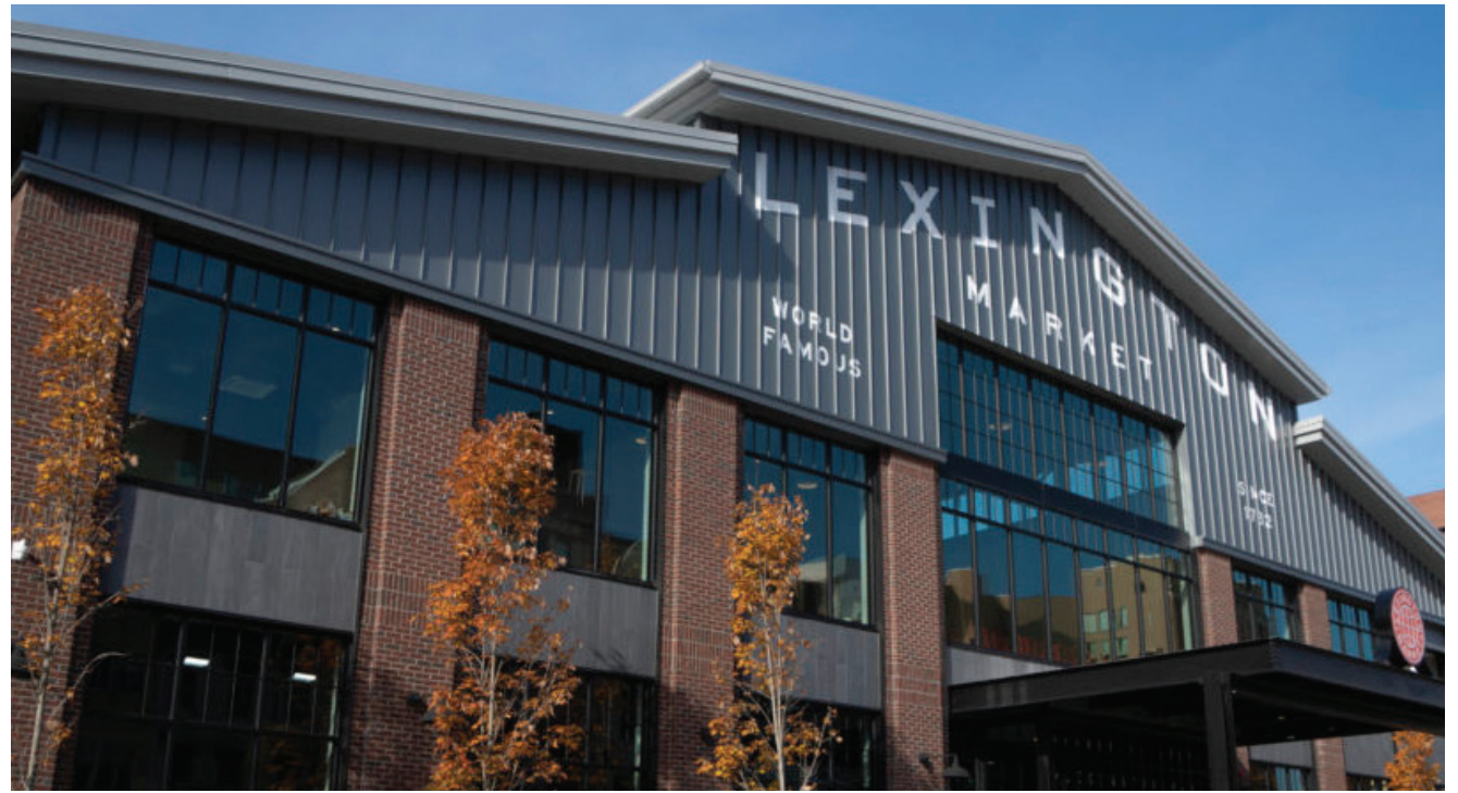
The newly remodeled Lexington Market.

Led by Baltimore Public Markets Corporation and Seawall Development, Lexington Market's revitalization includes funding from both the Maryland Department of General Services and the Maryland Department of Housing and Community Development. Between the two agencies, the state has invested