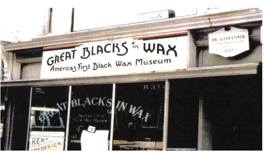
Yesterday: The National Great Blacks in Wax Museum's first location was a storefront on Saratoga Street.

She added, "He came back and said there was none. We wanted to put a face on our history that had been faceless, and all of this would lead to us