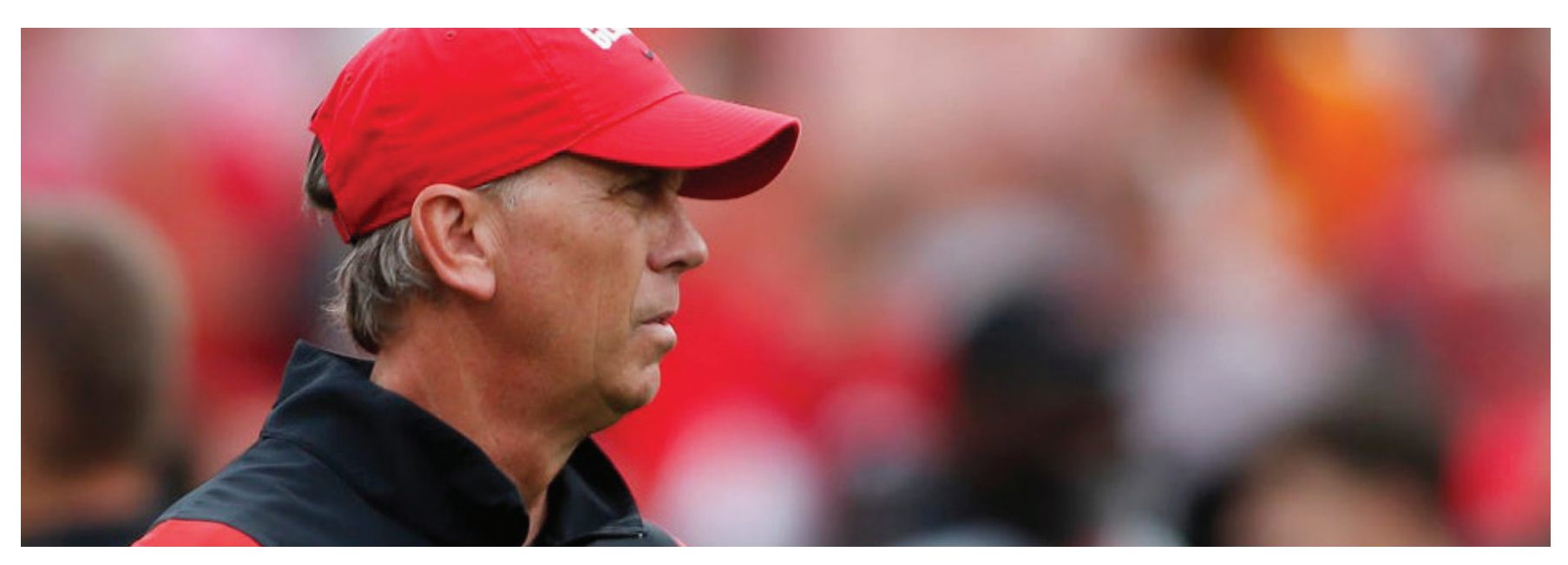
Todd Monken