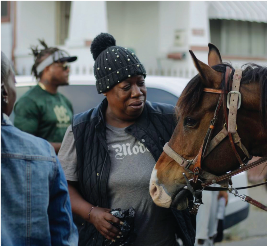
A community member interacts with a horse for the first time.