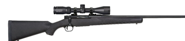
Purchase a raffle ticket for a chance to win this Mossberg Patriot .308 Rifle w/Vortex Scope.

Buy, sell or trade items will be on display on more than 30 tables from local and outstate vendors. All