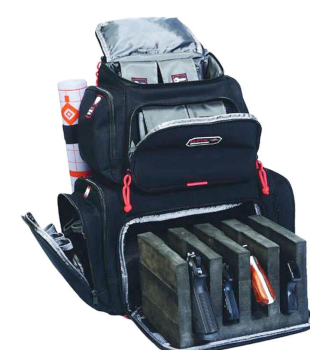
Along with other prizes, this freestanding Handgunner canvas backpack will be part of the raffle.