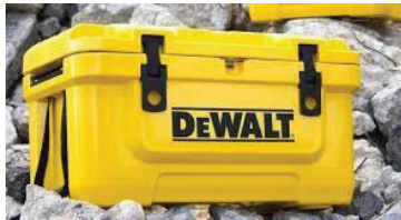
This DeWalt 65 quart Roto molded cooler will be part of the raffle.

The public is invited to attend the 25th annual Deerwood Outdoor & Gun Show on Saturday, March 4 from 9 a.m. to 5 p.m. and Sunday, March 5 from 10 a.m. to 3 p.m. at the Deerwood Auditorium.