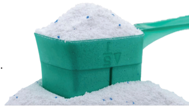
As part of its ongoing mission to educate the public about wise use of natural resources, Long Lake's team of Environmental Educators will share simple, everyday Conservation Tips that everyone, including kids, can do. If everyone makes the effort to consume resources more wisely, we can help ensure a brighter future for the planet and make life better TODAY!

What is happening in the starry sky this week: The full moon is on March 7th. For the Ojibwe people, March is the time of Onaabani giizis, or the Snow Crust Moon. The warming sun melts the top layers of snow, which re-freeze and become crusty. This is the time when the Ojibwe move from winter camp to the spring sugarbush camp. It's almost time to begin tapping maple trees to make maple sugar.