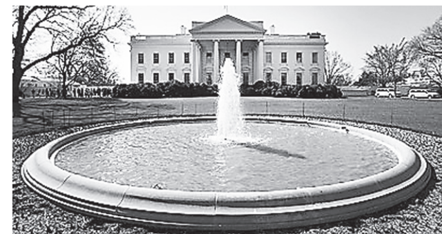
In the north White House fountain the water has been dyed green for Saint Patrick's Day every year since 2009.