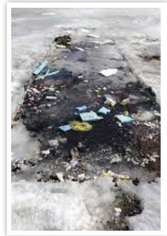
As part of its ongoing mission to educate the public about wise use of natural resources, Long Lake's team of Environmental Educators will share simple, everyday Conservation Tips that everyone, including kids, can do. If everyone makes the effort to consume resources more wisely, we can help ensure a brighter future for the planet and make life better TODAY!

Ice fishing season is coming to an end, and fish houses need to be removed from the lake. Before you pull your house off, take the extra time to thoroughly clean up. Remember, everything on the ice will end up in the water or on the bottom of the lake. Don't forget the pieces of lumber you use to level your houses and PLEASE don't dump your gray water in the lake. Leave no trace. Go to the Minnesota DNR website for helpful hints. https://www.dnr.state.mn.us/fishing/shelter.html