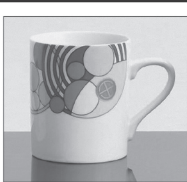
A set of six cups of Cabaret dinnerware sold at a Palm Beach Modern auction for $585.

A: If you have a dishwasher that is less than 10 years old, it probably washes most things safely. Exceptions include vintage, hollow-handled dinner knives, which can be a problem because old ones are sometimes filled with a substance that melts, and the knife blades loosen or turn. This also can happen to knives made with a stainless blade and different material for the handle. Don't wash your silver plate with any other metal tableware, or you can get a chemical reaction. Any dishes with metallic gold trim (it will spark) or metallic silver (the heat may turn the trim gray and poisonous) should not go in the microwave. Factory-made dishes should be OK; the decoration was put under clear glaze.