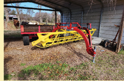
2012 kubota i4740 tractor 989 hrs, 2020 i4760

kubota tractor 197 hrs, mf hesston 1734 hay baler, hesston 1110 - 7' cutter, trailers and farm wagons, woods 10' bushhog, 16' cattle trailer, fence posts, cultivators, discs, pvc pipe, 3 bottom plow 12", antique tricycles & pedal tractor, mobil home axles, 15' car trailer, cultipacker, 6' road blade, 125+/- rolls hay, post driver & more.