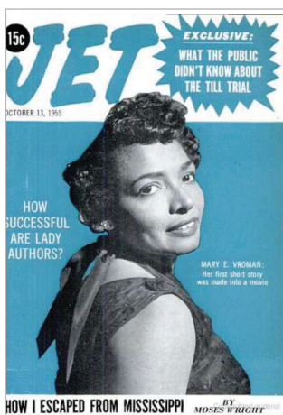
A JET cover from October 13, 1955.