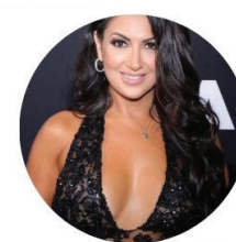
Rama Montakhabi Actress (Starz' 'BMF')