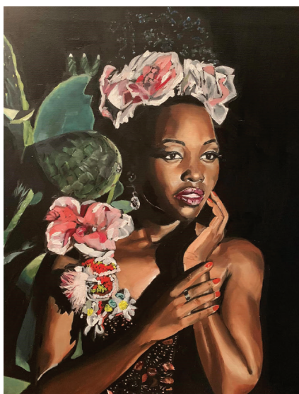
Anson Asaka's painting of Lupita Nyong'o.

the first one that I've had at a gallery. I've also had one at the National Great Blacks in Wax Museum. For a long period of time, I did not paint or draw. Fortunately, someone inspired me to get back into the arts."