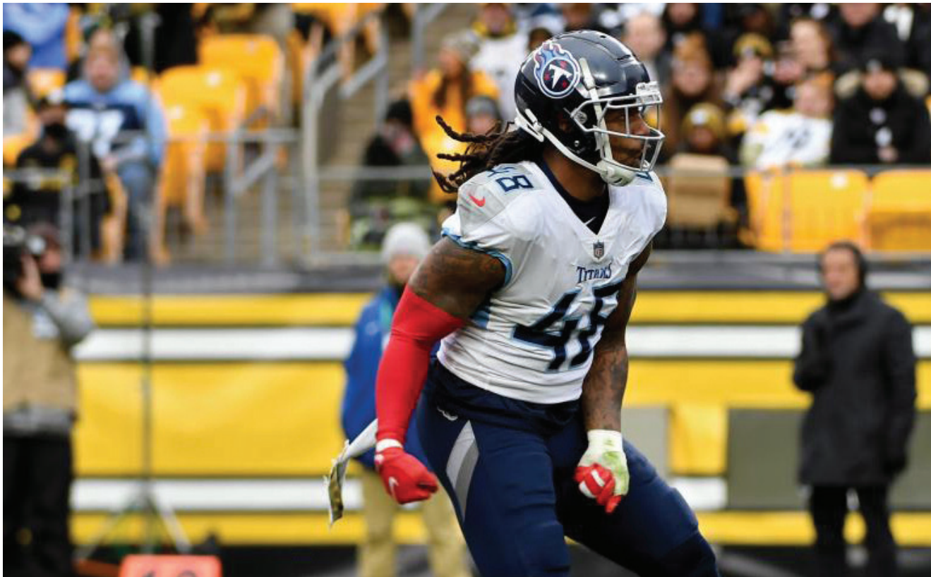
Bud Dupree